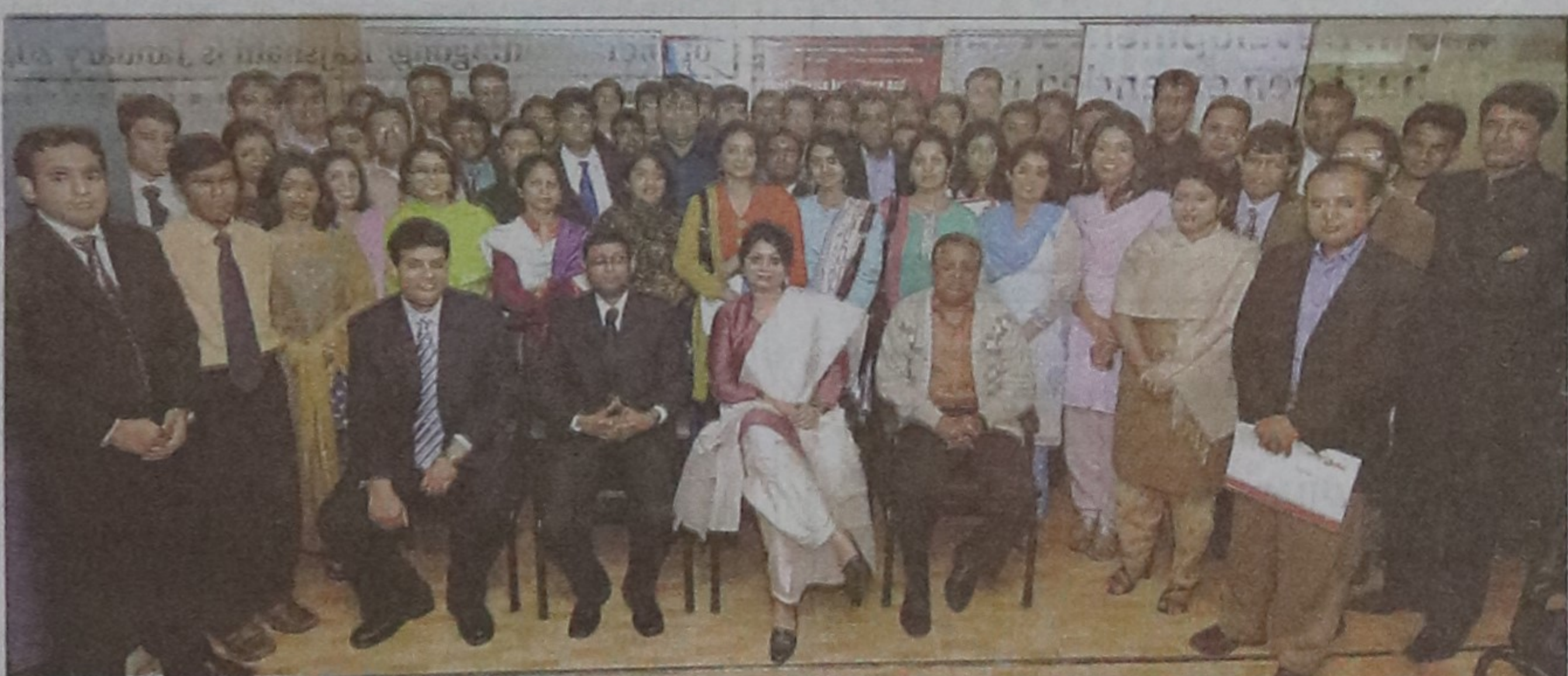
Participants pose with the guests at the closing session of a workshop on 'Customer service excellence and service culture' organised by Prothom Alo Jobs.com in the city yesterday.