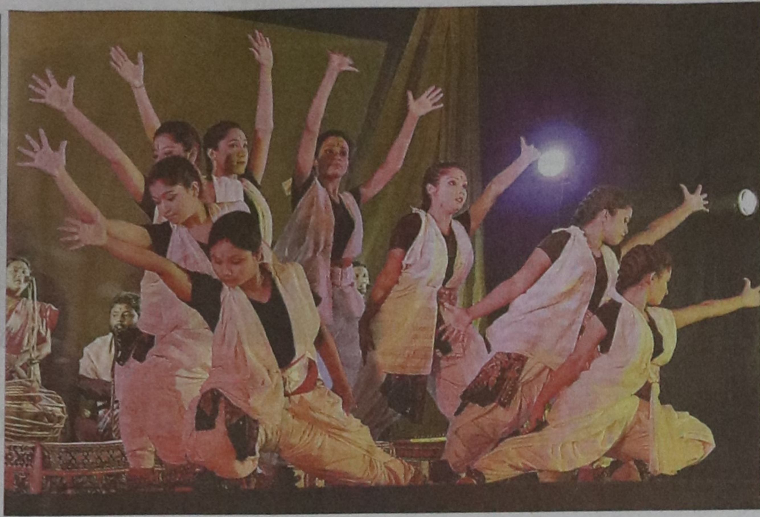
Artistes perform dance at a function marking the inauguration of Chhayanaut Sangskriti Bhaban Auditorium in the city yesterday.

According to a press release of the US Embassy, the centre will resume its regular hours of operation on January 19.