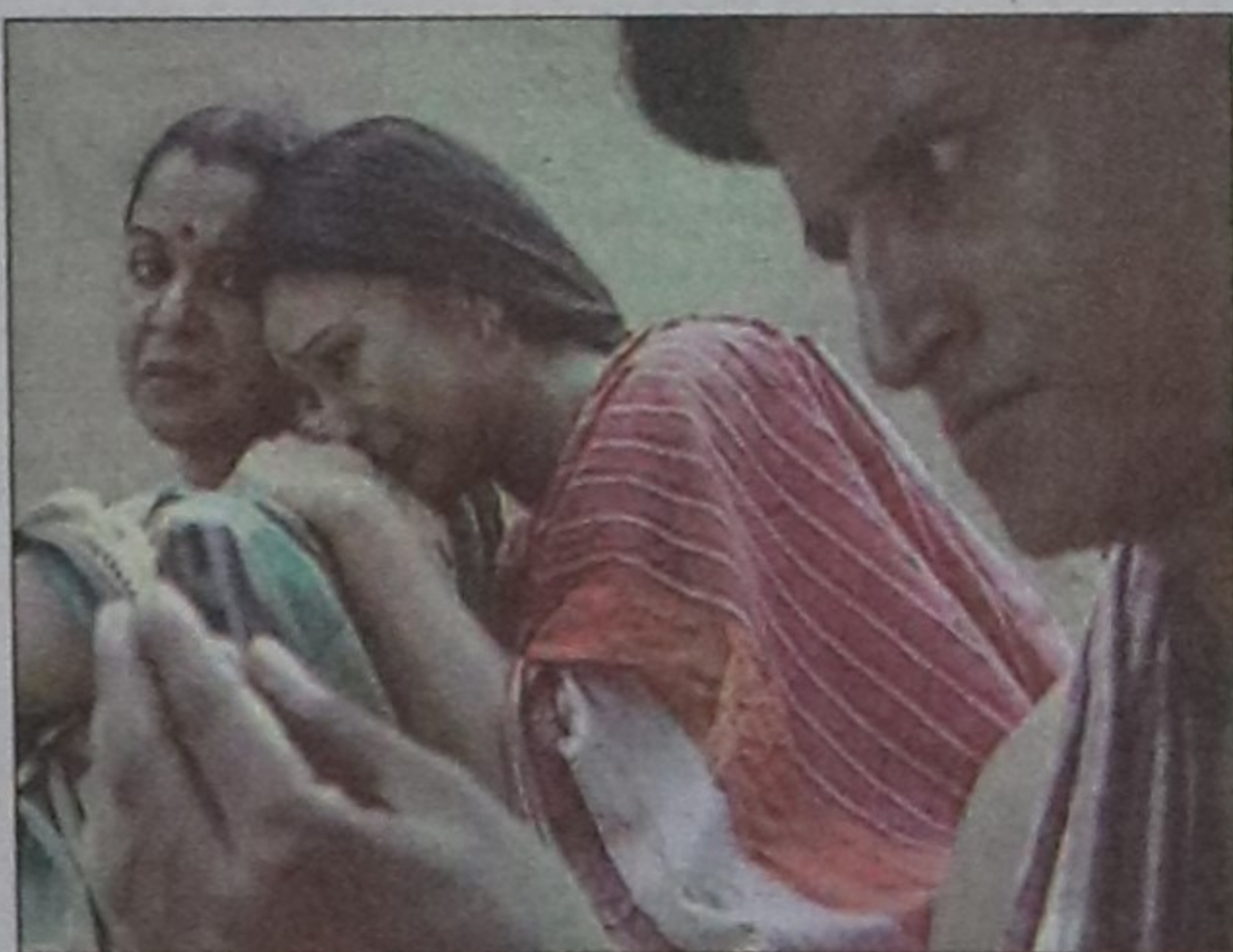
A scene from the serial.

The story follows the plight of six young individuals - Gaurango, Sikandar, Bulbul, Jewel, Rashid and Jainal - all from financially strained families. Each is from a different area of Bangladesh and they don't know each other, but their backgrounds and situations seem similar at times. At the cost of family property or savings, they go abroad in search of better prospects. They share a common goal -