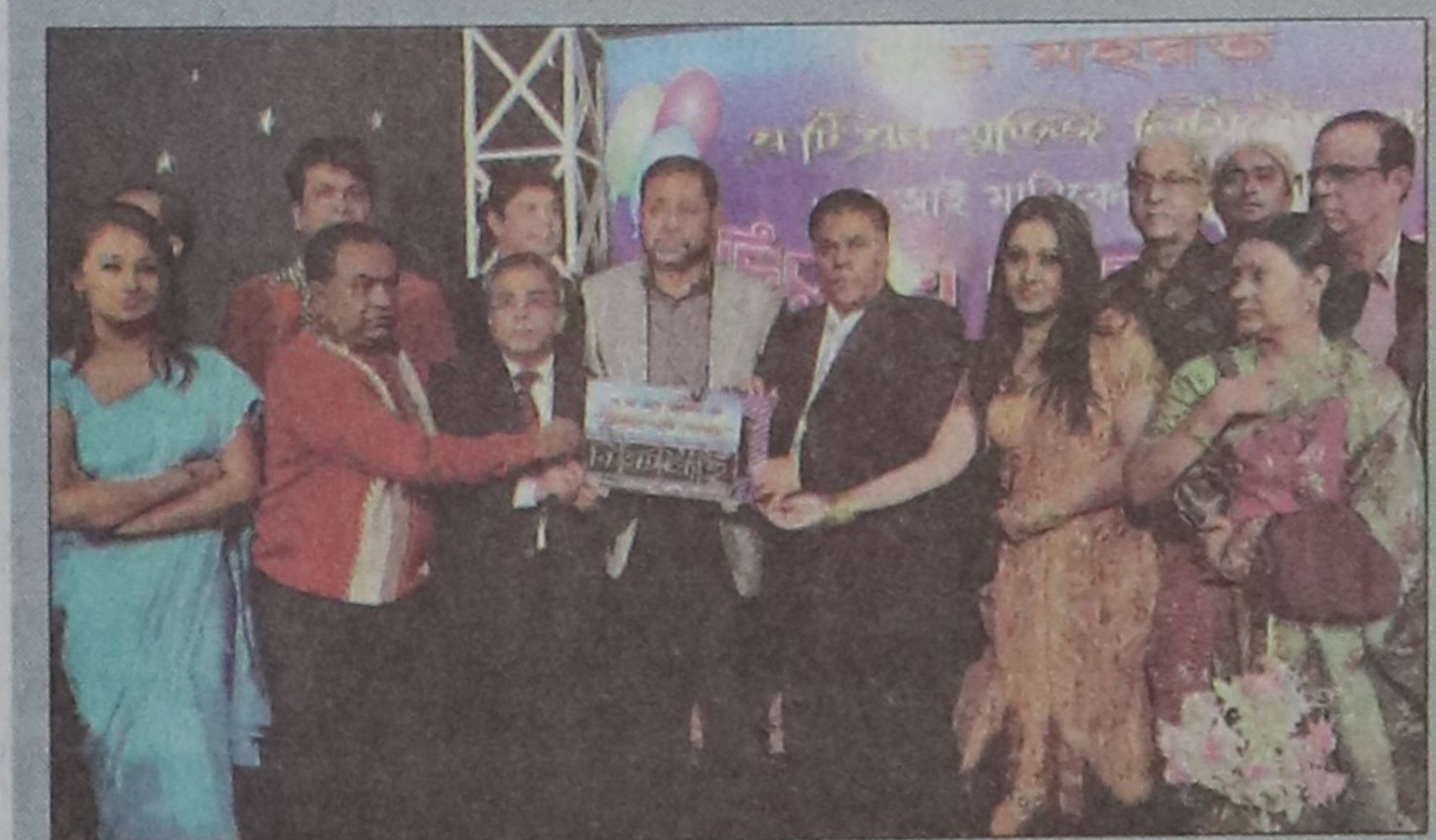
The 'mahorat' was attended by distinguished media personalities.

'Mahorat' (formal announcement) of "Chirodin Ami Tomar," the first film produced by ATN Movies (a concern of ATN Bangla), was held at BFDC on January 5, says a press release.