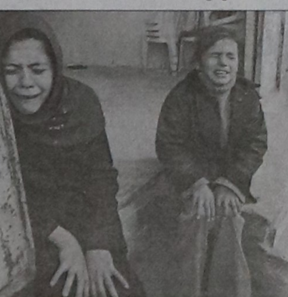
Palestinian relatives from the Deeb family cry yesterday during the funeral of 10 people from their family who were killed on Tuesday in an Israeli strike on a UN school in Gaza, in the Jabalia refugee camp, northern Gaza strip.