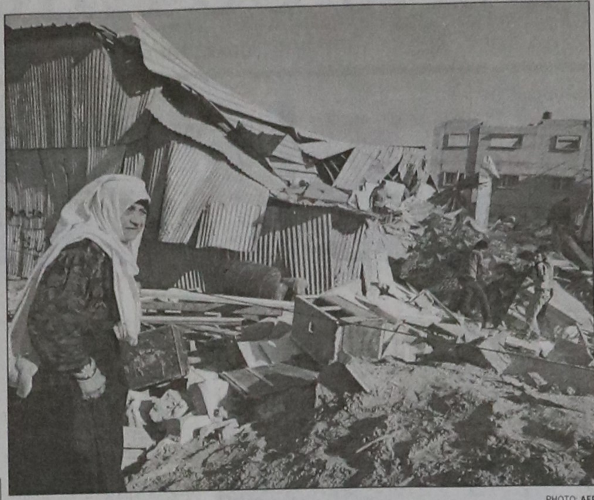
A Palestinian woman walks amidst the rubble of destroyed buildings following Israeli bombardments in Rafah, southern Gaza Strip yesterday. Egypt has drawn up contingency plans to deal with a sudden influx of thousands of Palestinian refugees fleeing the Israeli offensive in the Gaza Strip, humanitarian agencies said yesterday.