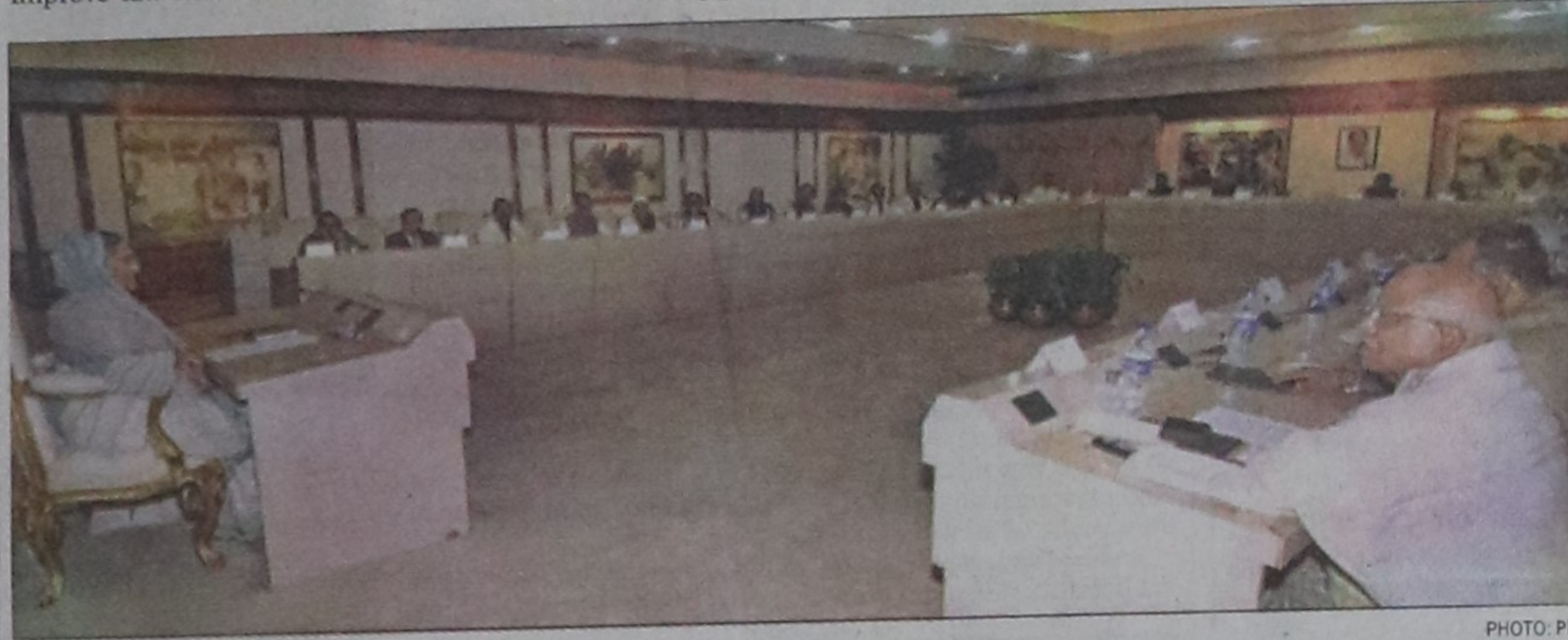
Prime Minister Sheikh Hasina addresses the first meeting of her cabinet held at the PMO yesterday.