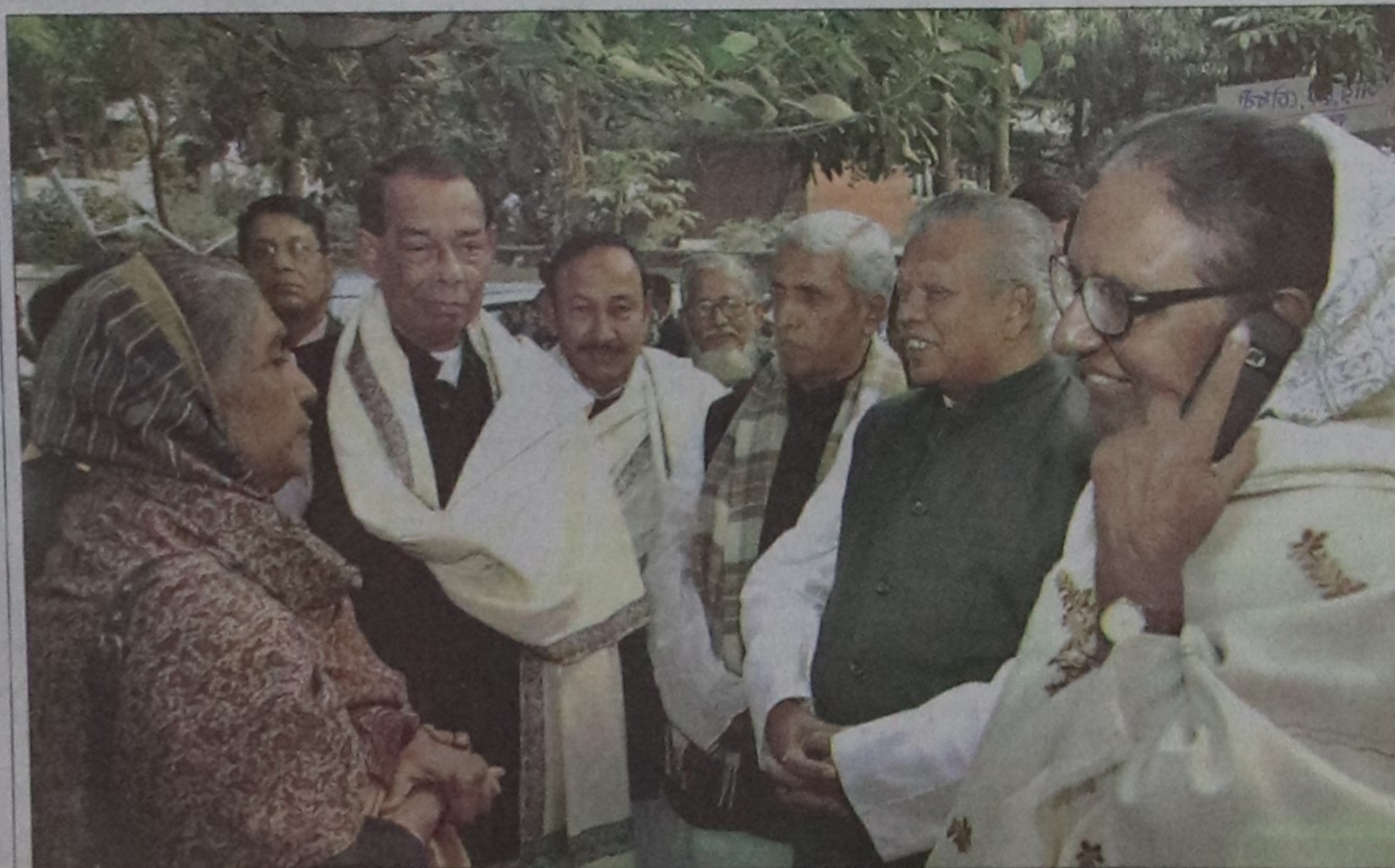
Agriculture Minister Matia Chowdhury and Home Minister advocate Sahara Khatun talk to senior AL leaders -- Suranjit Sengupta, Abdur Razzak and Amir Hossain Amu -- who were left out of the newly formed cabinet, in front of Bangabandhu Memorial Museum in Dhanmondi yesterday.

While on a journey towards Kufa, Hazrat Imam Hossain, his family members and a number of his followers were ambushed by the forces of Yazid at Karbala in Iraq SEE PAGE 15 COL 3