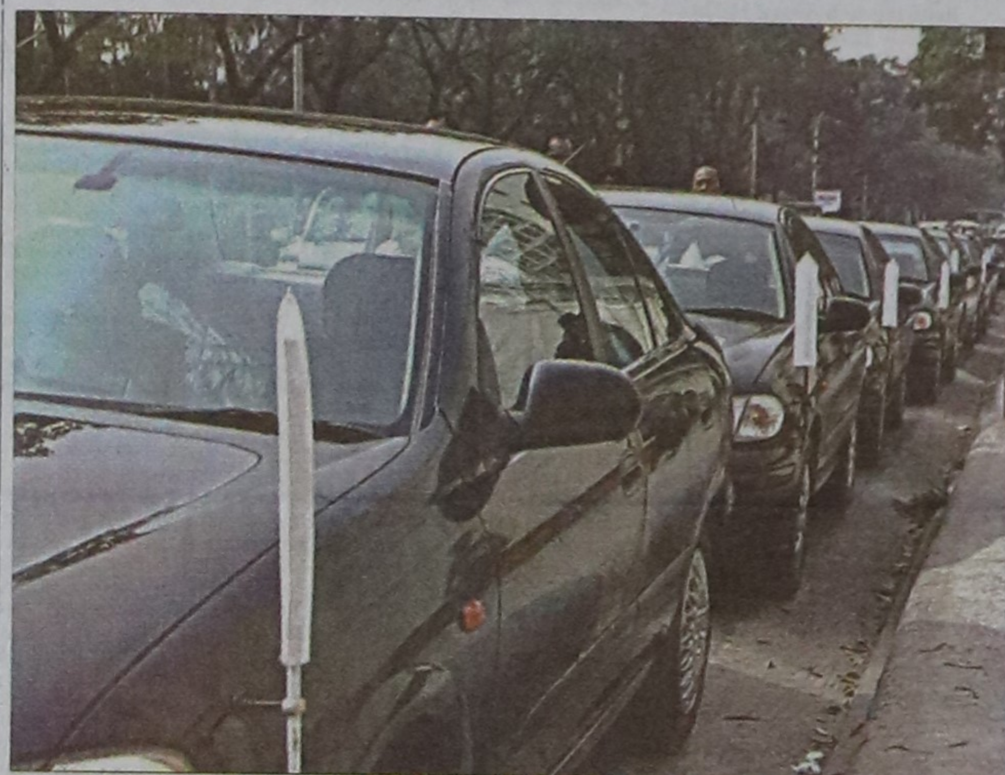
Government cars wait on Abdul Gani Road yesterday to take members of the new cabinet to the oath-taking ceremony at Bangabhaban.