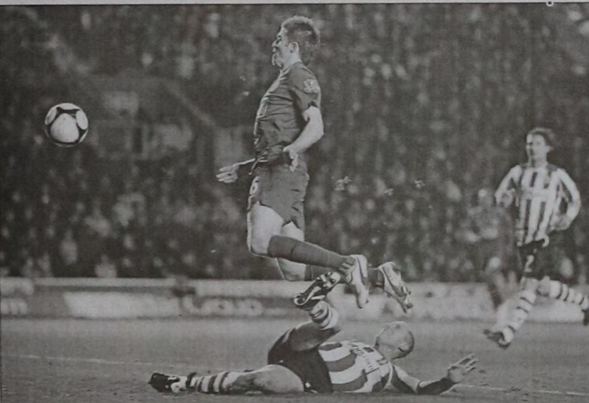
Manchester United midfielder Michael Carrick (top) tries to squirm away from the challenge of Southampton defender Chris Perry during their FA Cup tie at the St Mary Stadium in Southampton on Sunday.