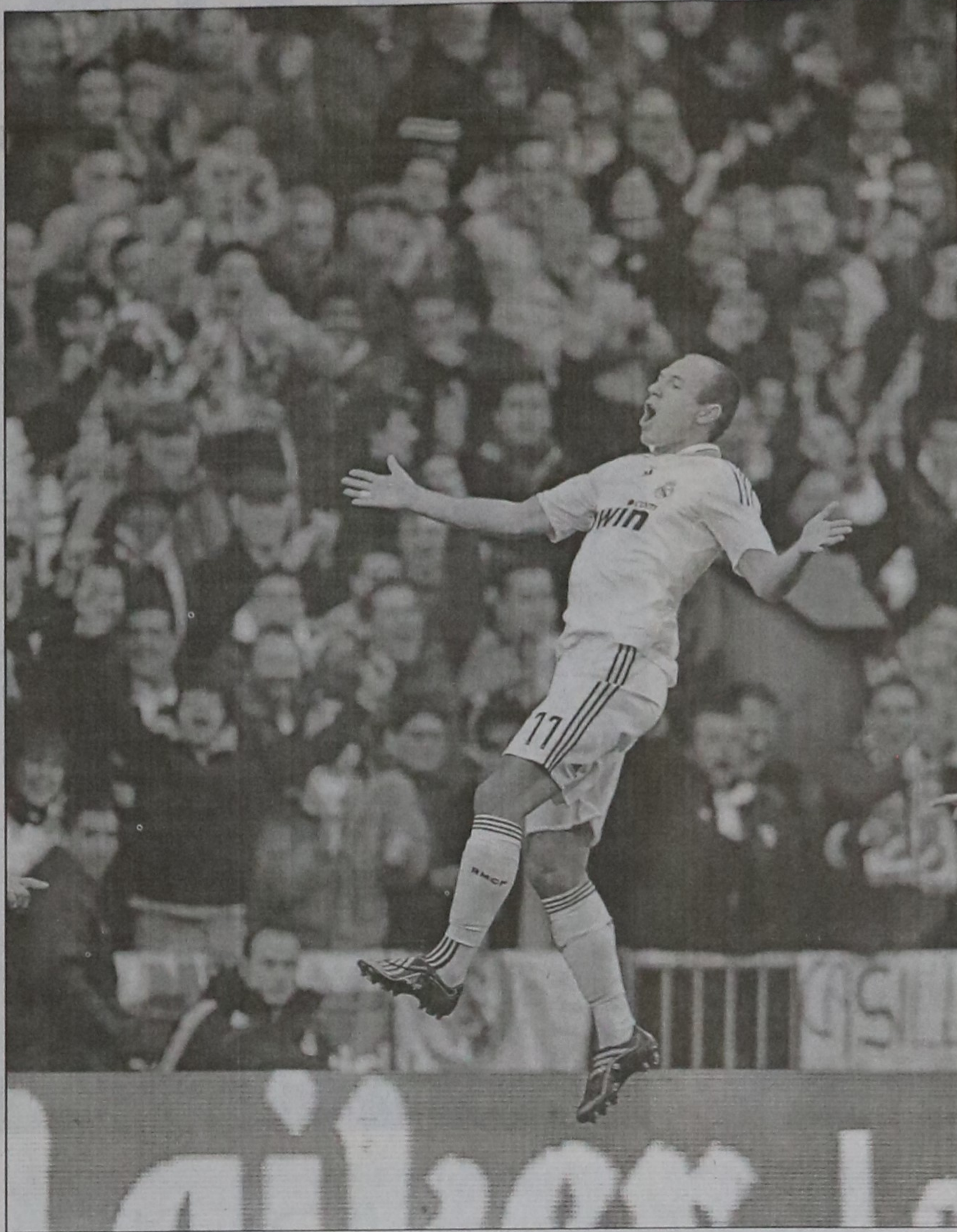
Real Madrid winger Arjen Robben goes airborne to celebrate his stunning goal in their Primera Liga match against Villarreal at the Santiago Bernabeu in Madrid on Sunday. Robben's fantastic strike saw Real home against the spirited Yellow Submarines and made sure that they stay within sight of league leaders Barcelona.

Elsewhere Recreativo Huelva did their chances of staying up a power of good with a 3-1 win over Numancia on Sunday that lifted them out of the bottom three.