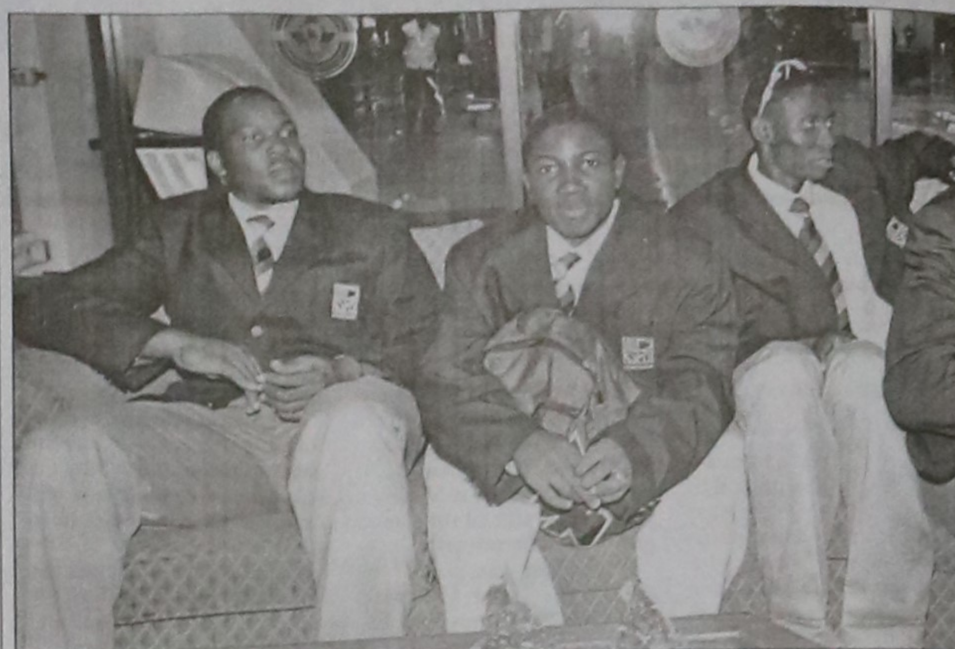
Star Zimbabwe batsman Tatenda Taibu (C) shows little signs of jetlag after arriving at the Zia International Airport yesterday. Zimbabwe cricket players are in the city to feature in a tri-nation one-day tournament that starts on January 10.

Bowler O M R W Mashrafe 2 1 5 0 Shahadat 1 0 4 0 Shakib 1 0 1 0 Enamul 1 0 3 0