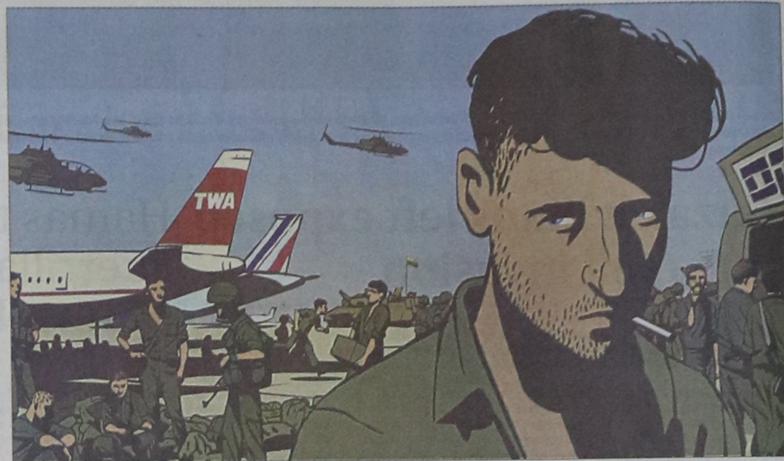
The critics' association chose "Waltz With Bashir" as the year's best film in a surprise move.