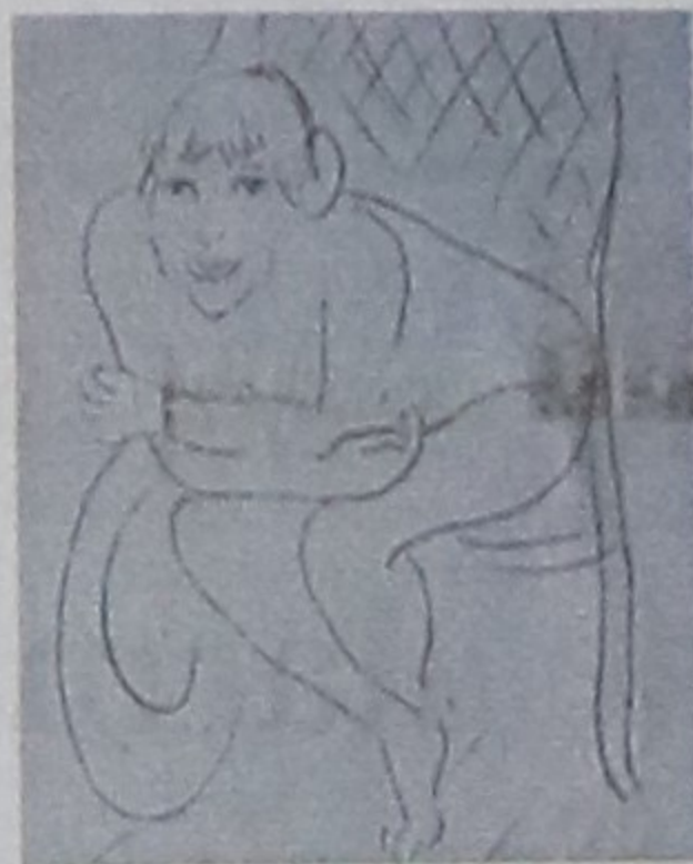
Stolen from a gallery in Berlin, Matisse's "Nude in a rocking chair" is missing.