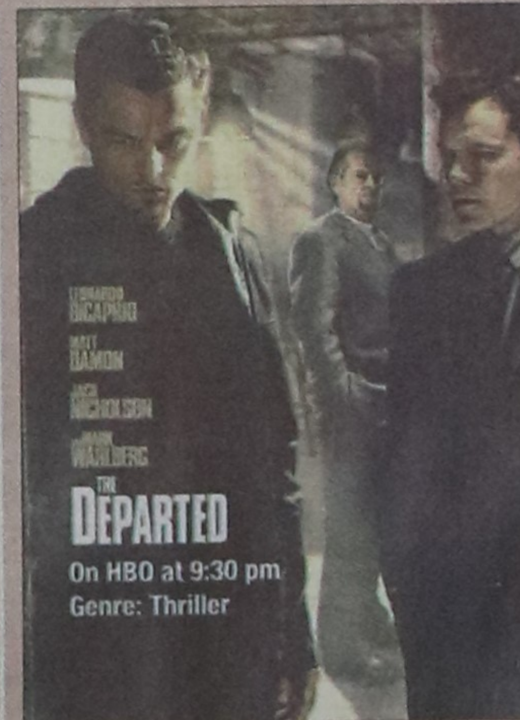
On HBO at 9:30 pm Genre: Thriller

Radio Today 89.6 FM 07:15am Good Morning Dhaka 11:00am Masti Unlimited 01:00pm Today's Adda 04:00pm U-tun 08:00pm Tobe Tai Hok 11:00pm Raat Vor Gan