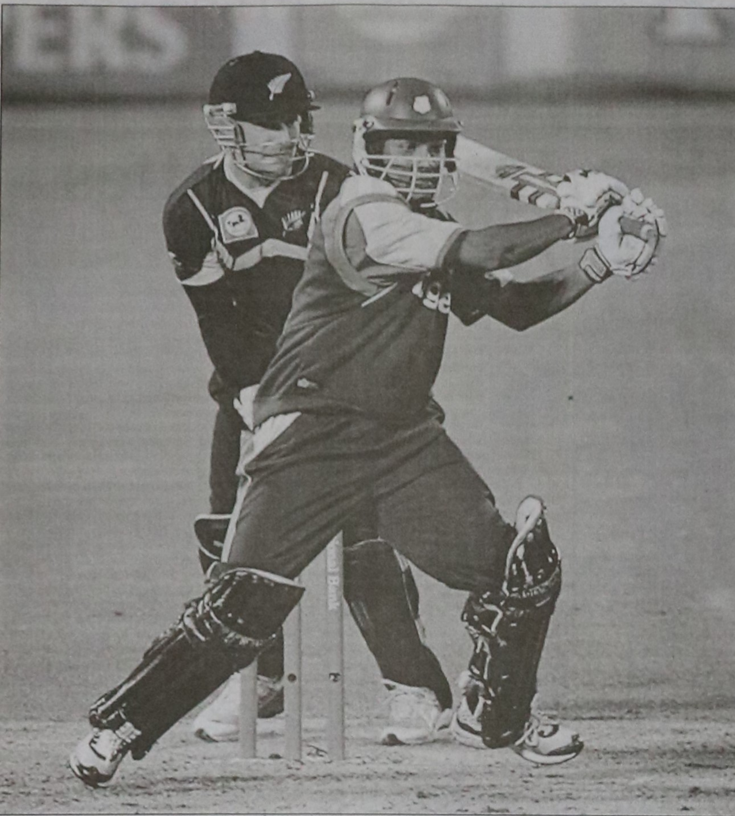
West Indies batsman Ramnaresh Sarwan pulls one over mid-wicket during his match-winning knock of 67 not out in the second one-day international against New Zealand at AMI Stadium in Christchurch yesterday.