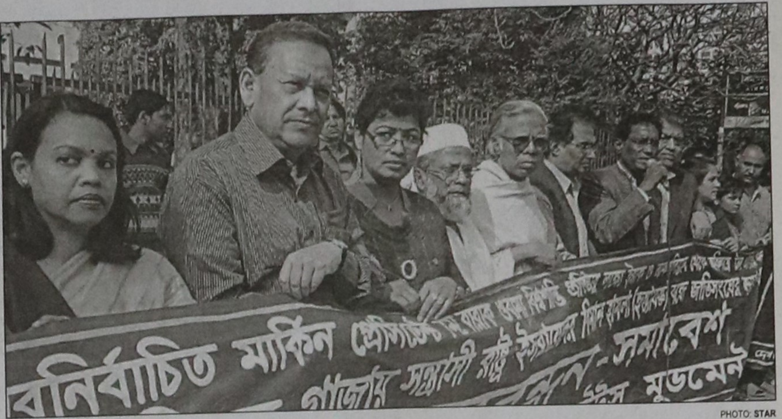
Citizens' Rights Movement forms a human chain at Shahbagh intersection in the city yesterday protesting the Israeli air strike on Gaza Strip in Palestine.

Both the president and the chief adviser wished good health, happiness and long life of their counterparts and continued peace, progress and prosperity of the friendly people of Myanmar.