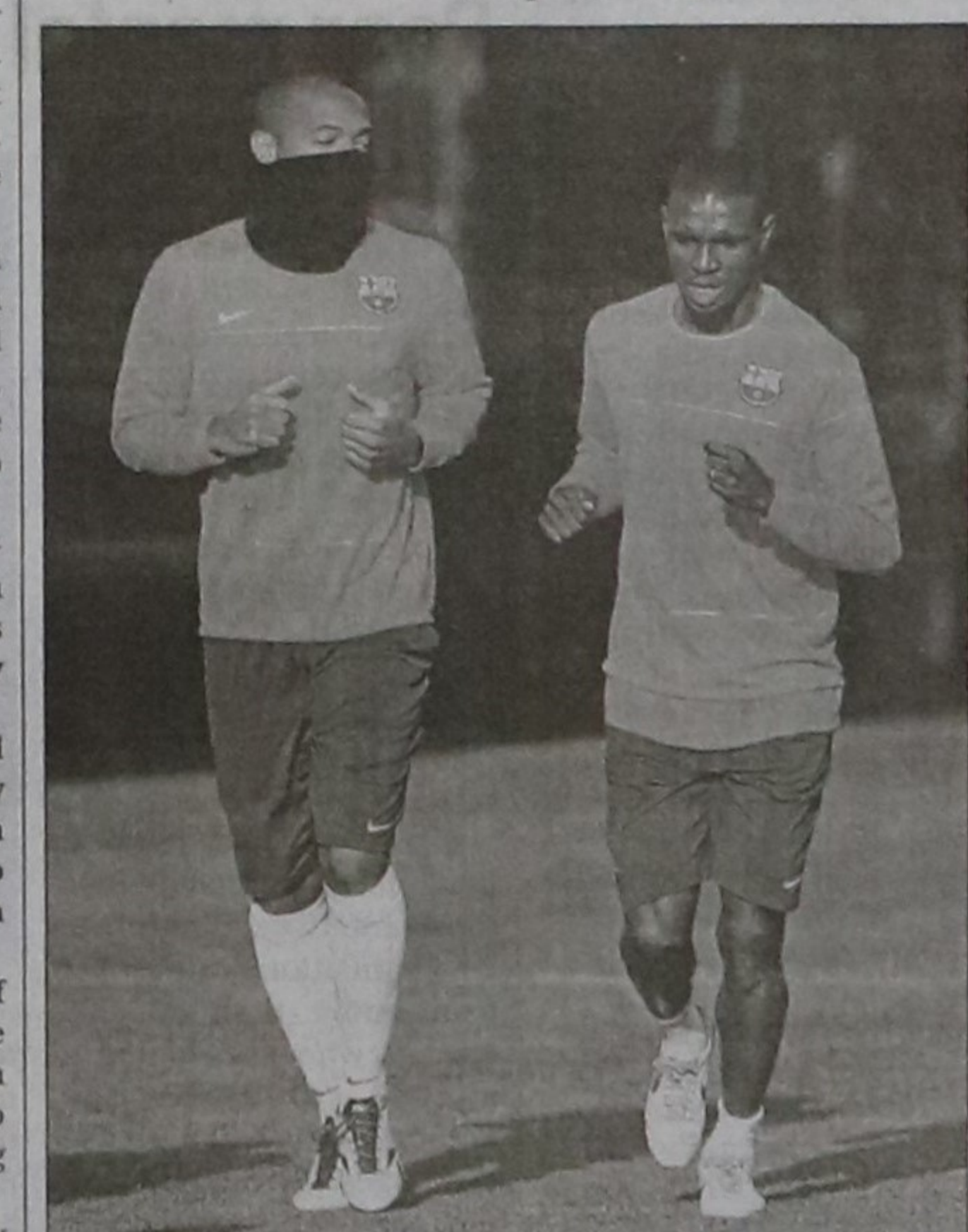
THE CLOAKED MAN: Barcelona striker Thierry Henry (L) wearing a face cover and teammate Eric Abidal take part in a training session in Barcelona on Wednesday.

"PSV is at this point in my career not my first option. Only when no other big foreign clubs call us will PSV come into the picture."