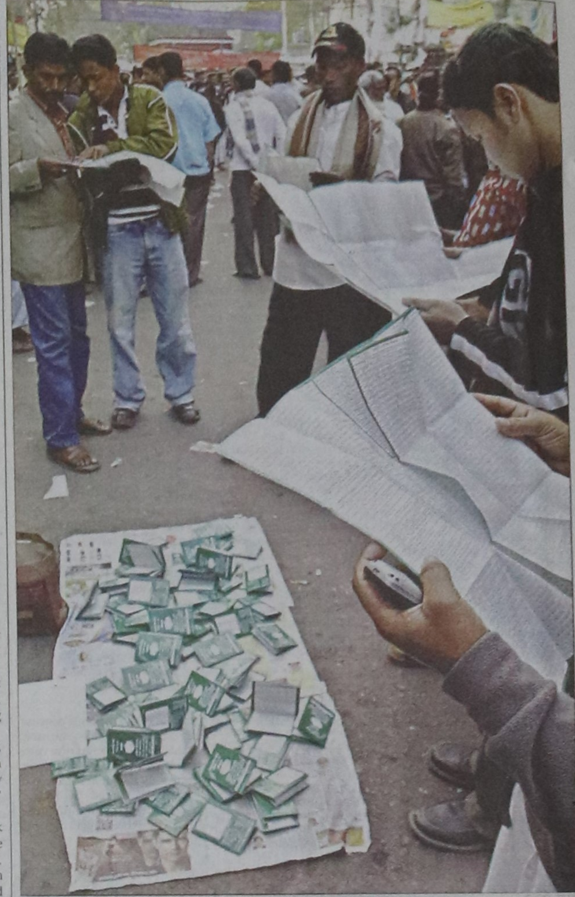
A section of innovative traders makes some quick bucks selling booklets on the December 29 election results at Bangabandhu Avenue yesterday.