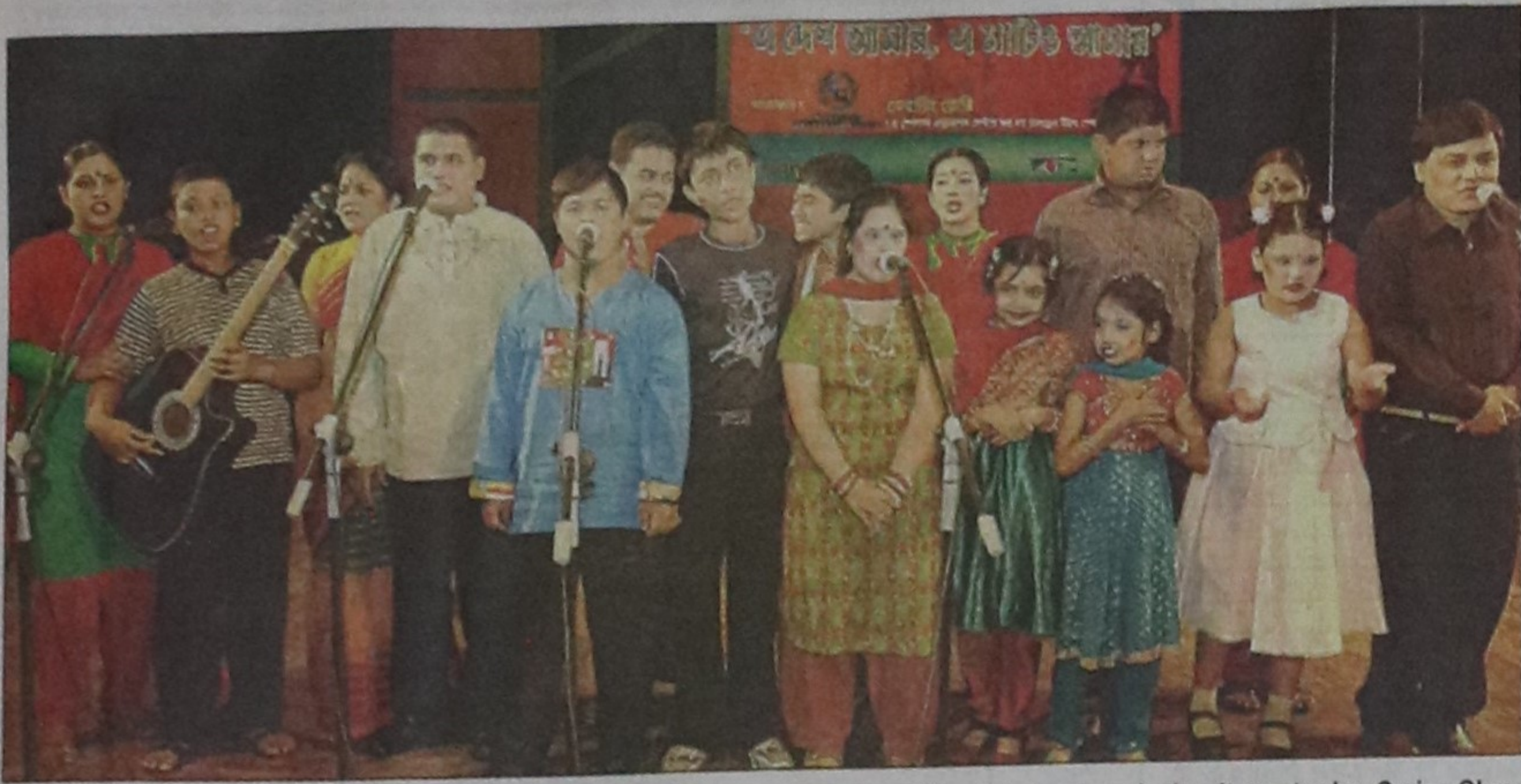
Autistic children perform at a cultural programme styled 'My Country, My Soil' at Shilpakala Academy in the city yesterday. Caring Glory, a special education centre, and ActionAid Bangladesh jointly organised the programme.