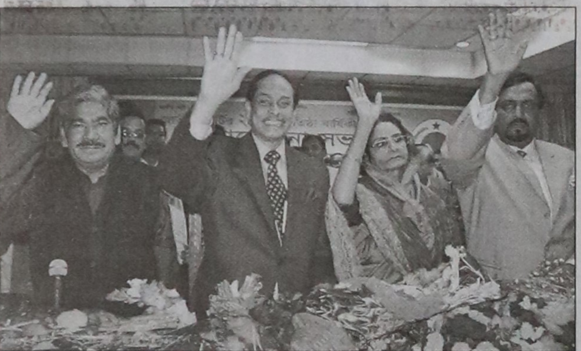
Jatiya Party Chairman HM Ershad and other leaders wave at party supporters and activists at a discussion marking the 24th founding anniversary of the party at Engineers Institution auditorium in the city yesterday.

Bangladesh Muktiyoddha Parishad also hailed the victory of the AL-led grand alliance.