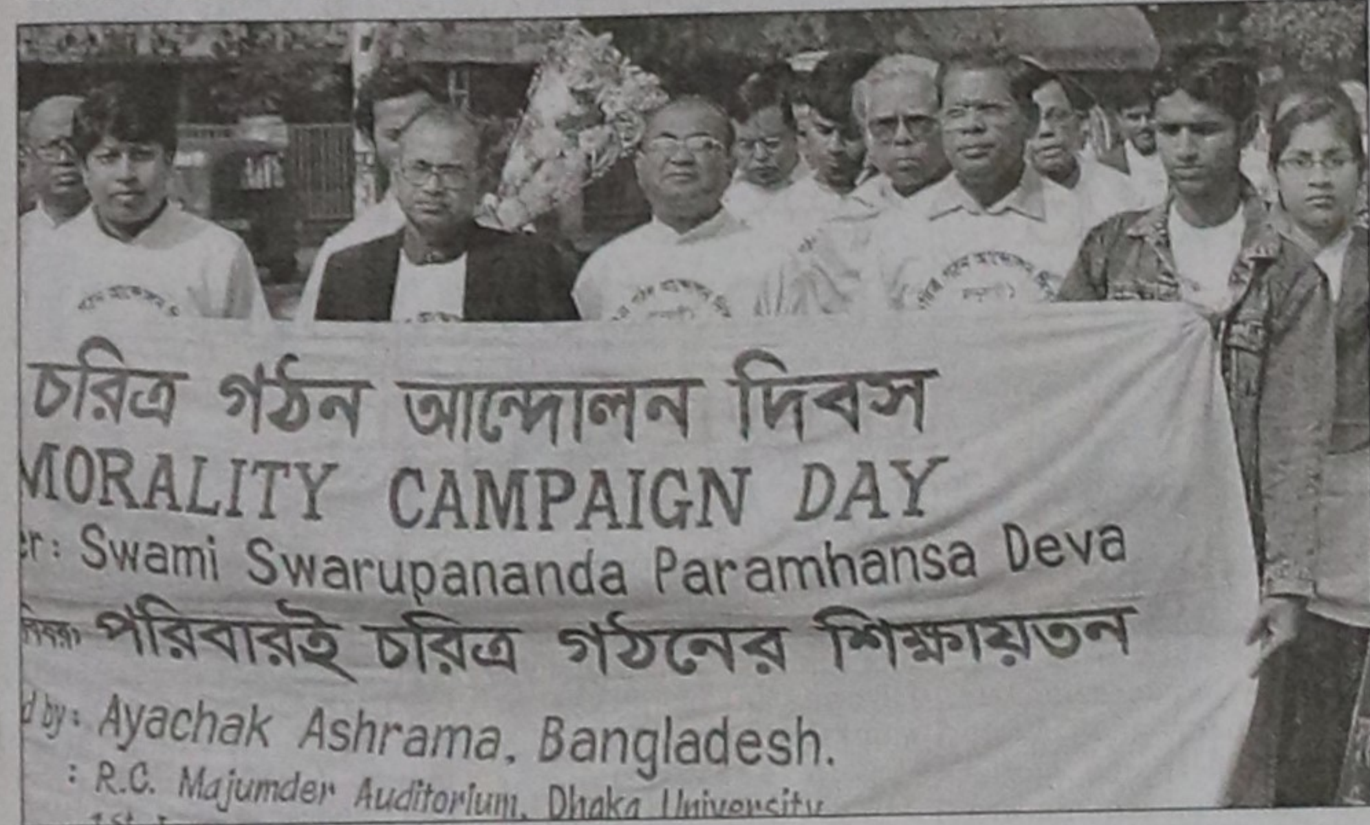
Ayachak Ashram, Bangladesh takes out a procession on the Dhaka University campus yesterday to mark the Morality Campaign Day.