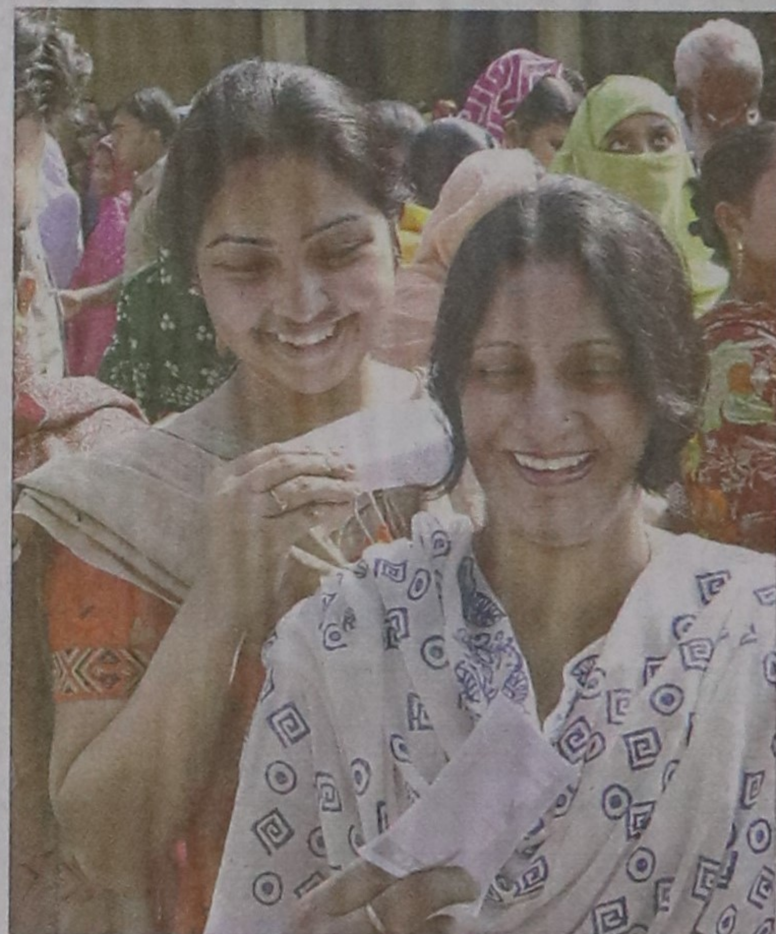
Voters line up at a Dhaka polling centre on Monday. The new government will have to tackle a string of pressing economic issues in the days ahead.

Our domestic savings are increasing but it is not sufficient to propel the needed growth, as is the case in many developing countries. Alternatives to domestic savings could be foreign aid, loans, or international commercial capital.