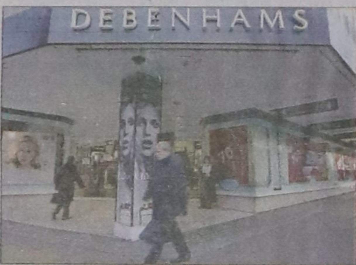
A Debenhams department store is pictured in central London on Tuesday. Debenhams, Britain's biggest department store, is planning to raise extra cash in a bid to reduce debt levels according to the Financial Times newspaper.

The contract for a custodian has not yet been awarded. The central bank has already begun purchasing up to 100 billion dollars in mortgage-backed securities on its own and will buy up to 500 billion more through these investment firms.