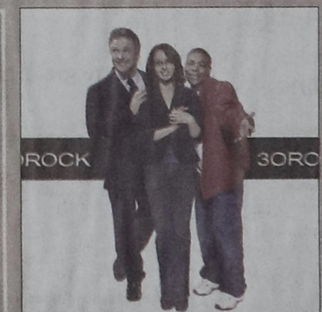
30 Rock On Star Bangla at 9:30 pm TV Series Cast: Alec Baldwin, Tina Fey