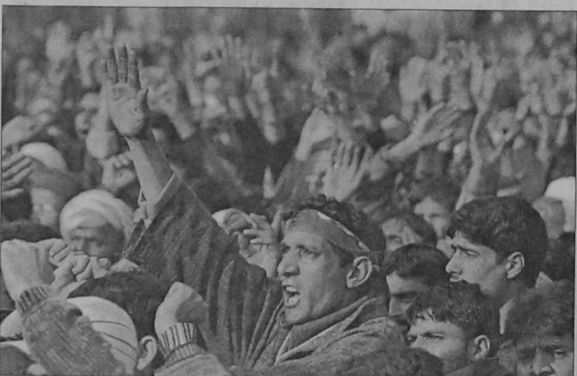
Supporters of the National Conference (NC), the oldest political party in Kashmir, chant slogans to respond to a point raised by unseen party president and chief minister designate Omar Abdullah during a public speech in Srinagar yesterday. Omar arrived to a warm reception in Srinagar by his supporters after holding discussions with the Congress leadership in New Delhi towards cobbling a coalition to rule the restive state for the next six years.

The National Conference won 28 of the state assembly's 87 seats, while the Congress party bagged 17.