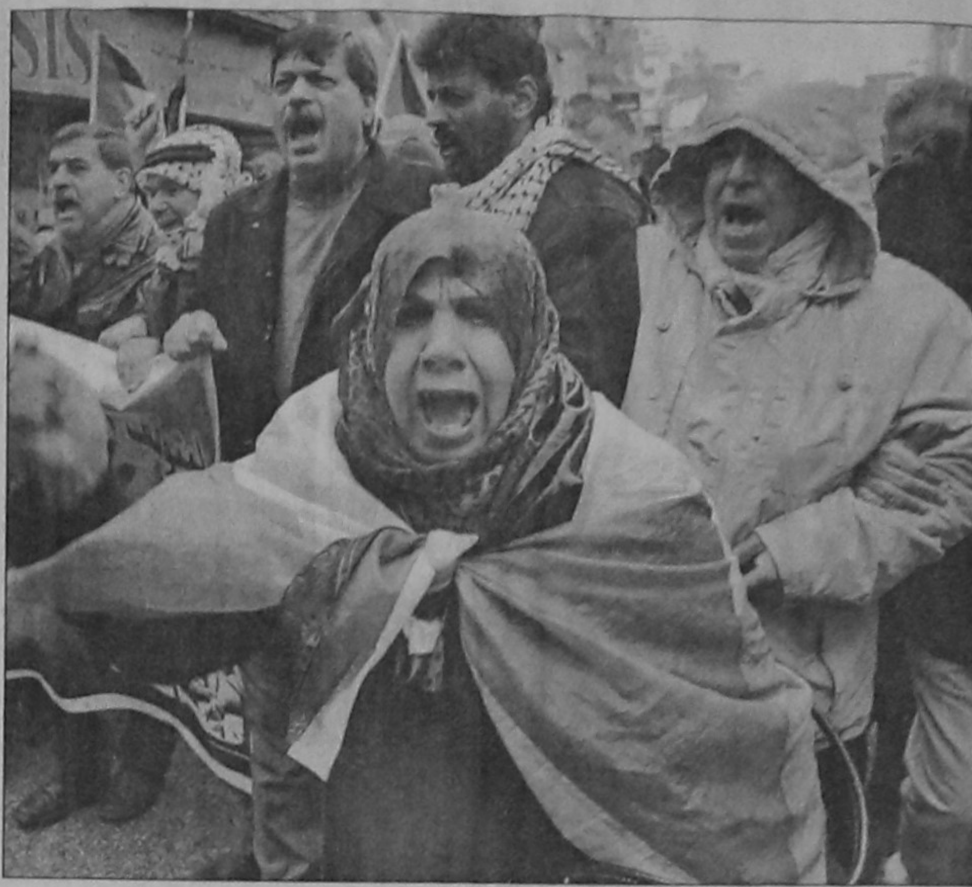
Palestinian demonstrators shout slogans in the West Bank city of Ramallah yesterday during a protest against the Israeli air strikes on the Gaza Strip. Amid mushrooming protests around the globe, diplomats scrambled to find a way to halt one of Israel's deadliest-ever offensives on Gaza that has so far killed at least 390 Palestinians.