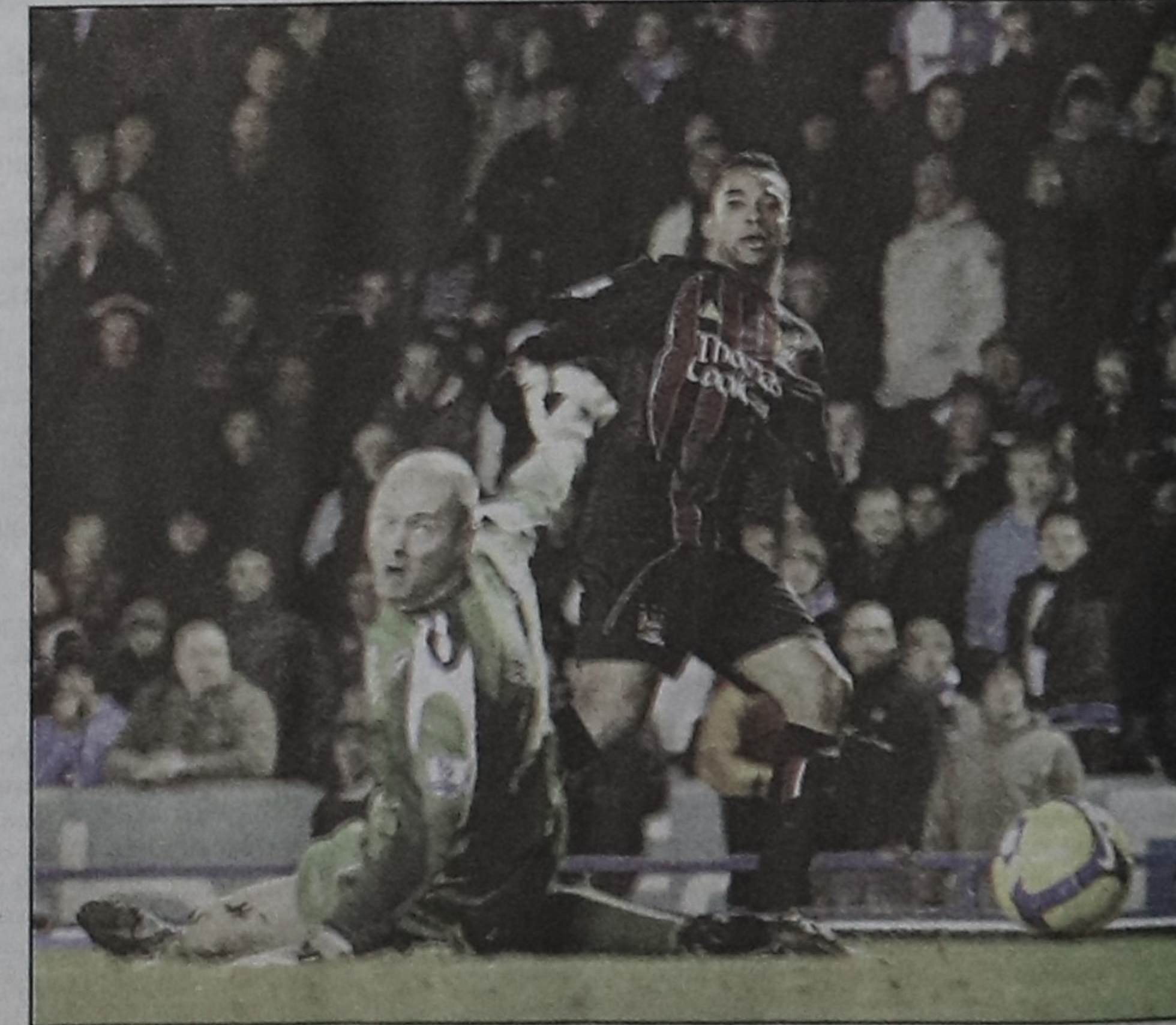
Manchester City forward Robinho (R) scores the equalising goal past the despairing dive of Blackburn goalkeeper Paul Robinson during their Premiership encounter at Ewood Park on Sunday.