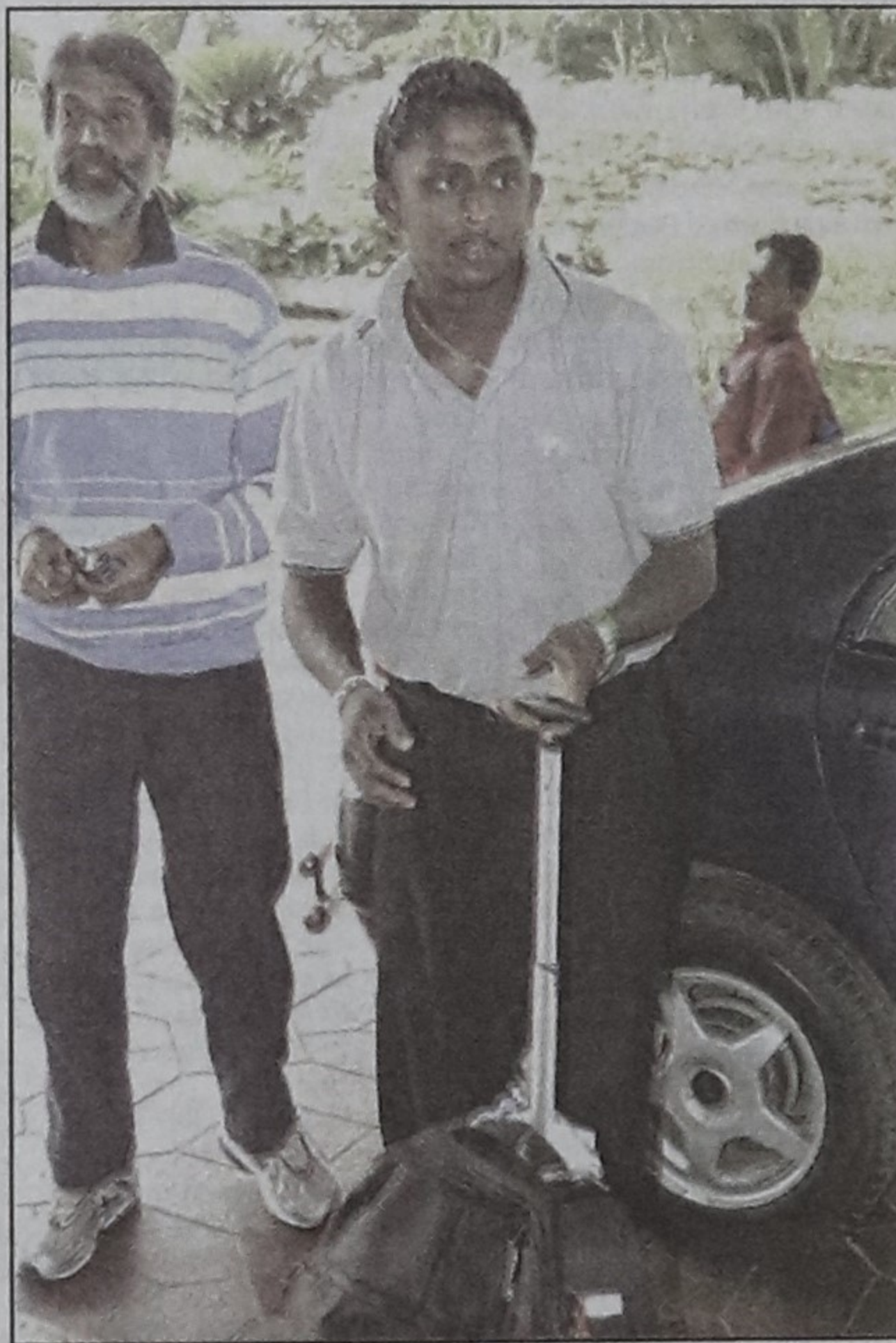
Sri Lanka's sensational off-spinner Ajanta Mendis (R) enters the Sheraton Hotel yesterday. The young twerker missed the ongoing first Test due to ankle injury but is likely to be available for the second Test starting at Chittagong on January 3.