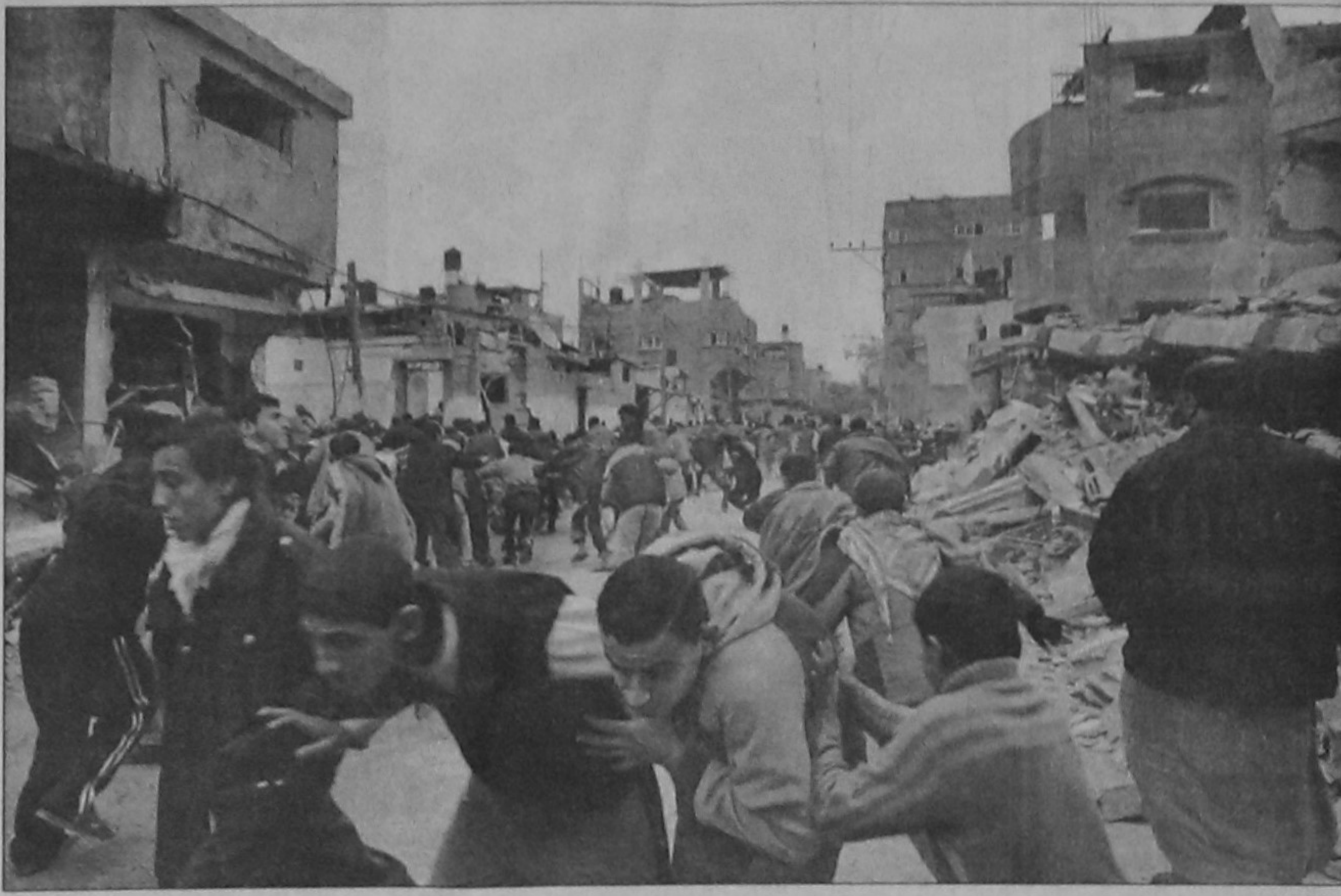
PHOTO: B Palestinian civilians run during an Israeli airstrike in the Jabalia refugee camp, northern Gaza Strip yesterday. Israeli Defence Minister Ehud Barak said Monday that Israel was in an "all-out war against Hamas" as the Jewish state continued its massive bombardment of the Islamist movement's installations in Gaza.