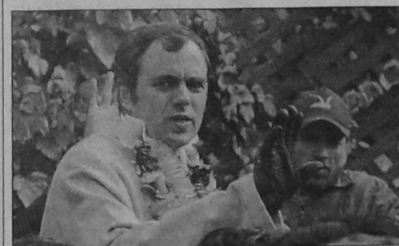
President of the National Conference and chief ministerial candidate Omar Abdullah addresses supporters a day after his election victory in Srinagar yesterday.

38-year-old Omar, on his part, said he will be guided by his father.