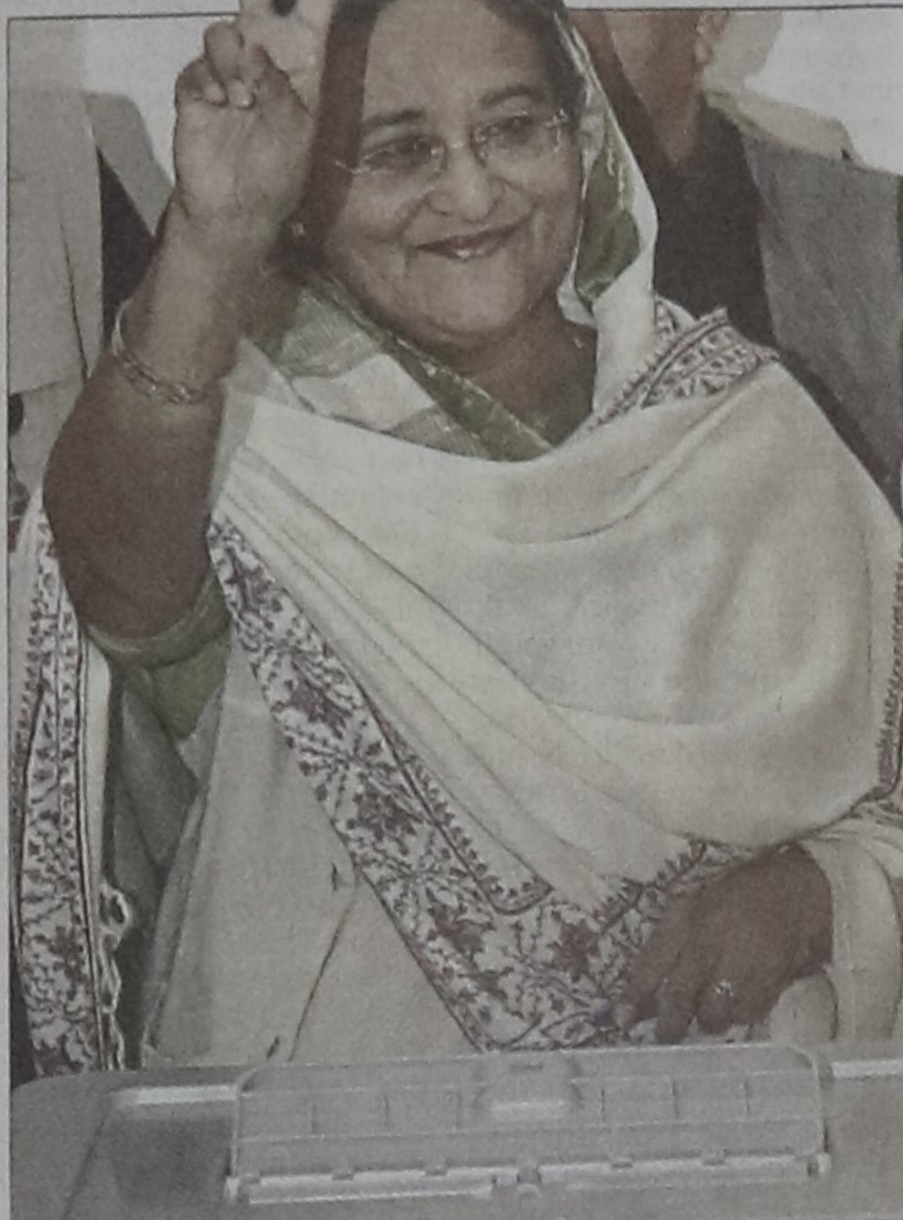
Hasina flashes V-sign after casting vote.