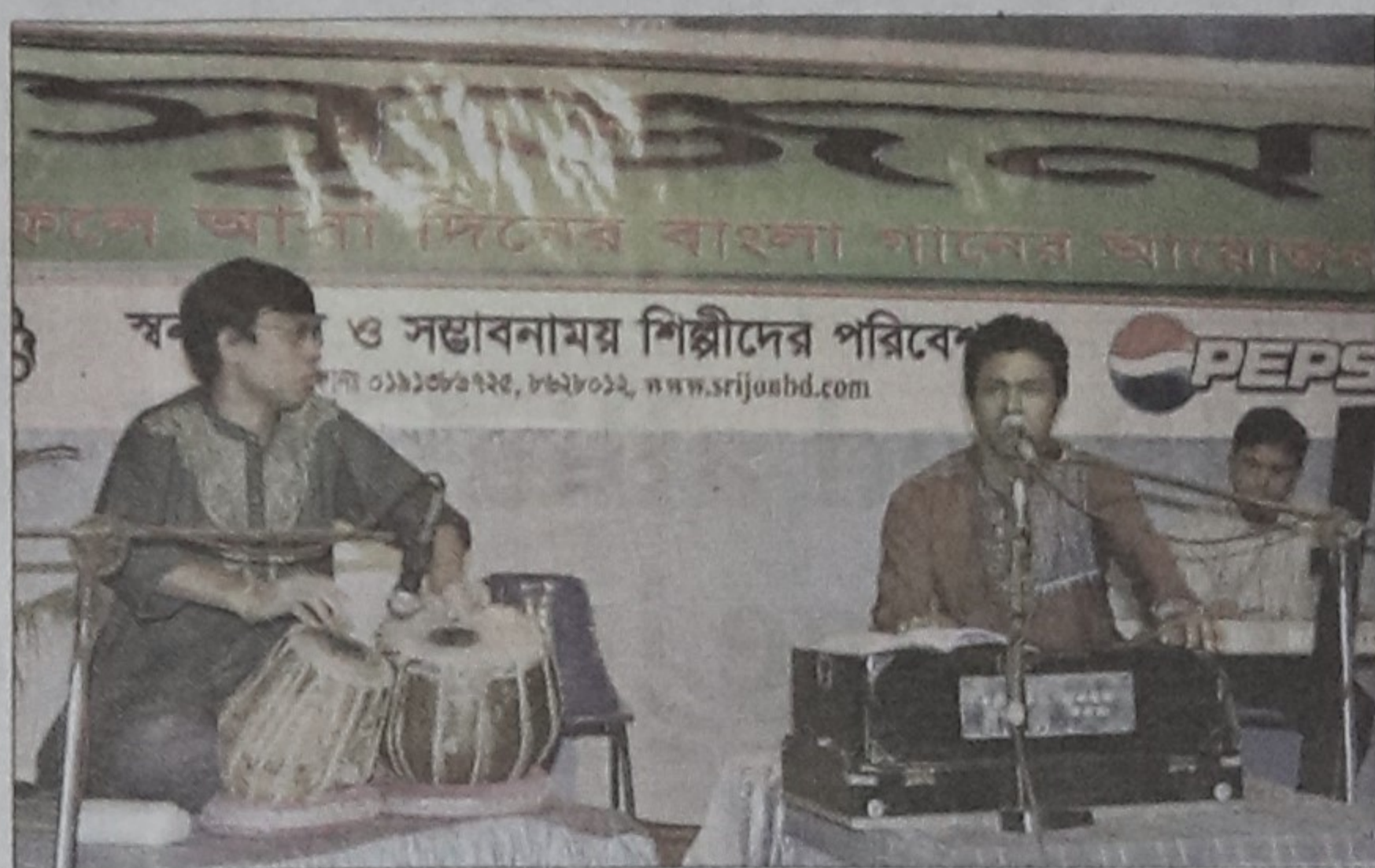
An artiste sings at the programme.