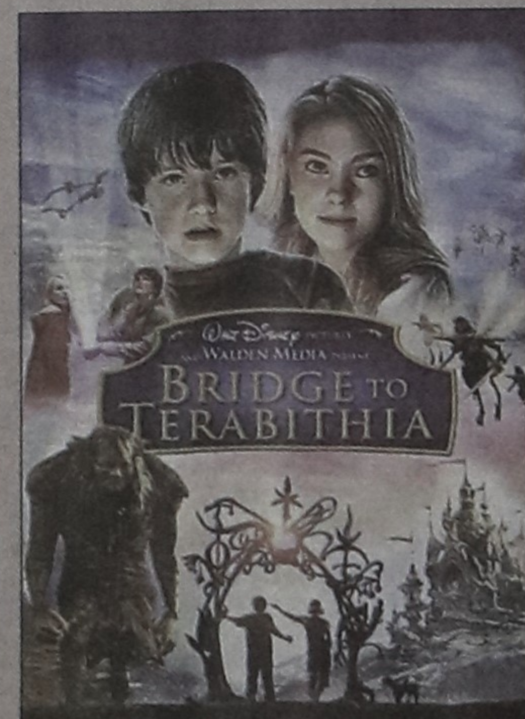
On Star Movies at 7:00 pm Genre: Fantasy/Drama Cast: Josh Hutcherson, AnnaSophia Robb

Radio Foorti 88.0 FM 07:30am Hello Dhaka 10:00am Music Junction 12:00pm My Time 01:00pm No Tension 04:00pm Dhaka Calling 09:30pm Night Rider 01:00am Back to Back music Radio Today 89.6 FM 07:15am Good Morning Dhaka 11:00am Masti Unlimited 01:00pm Today's Adda 04:00pm U-lum 08:00pm Tobe Tai Hok 11:00pm Raat Vor Gan 02:00 am Back to Back