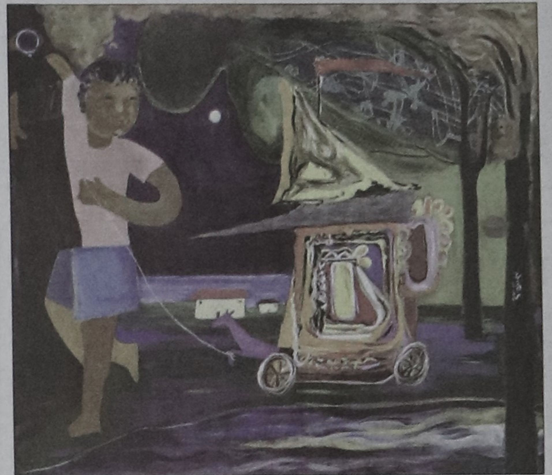
Chariot of Life

Another work that captivates the viewer is My Village, once again in mixed media. With child-like lines, Ghosh reveals the view of a village through a child's eyes. "I