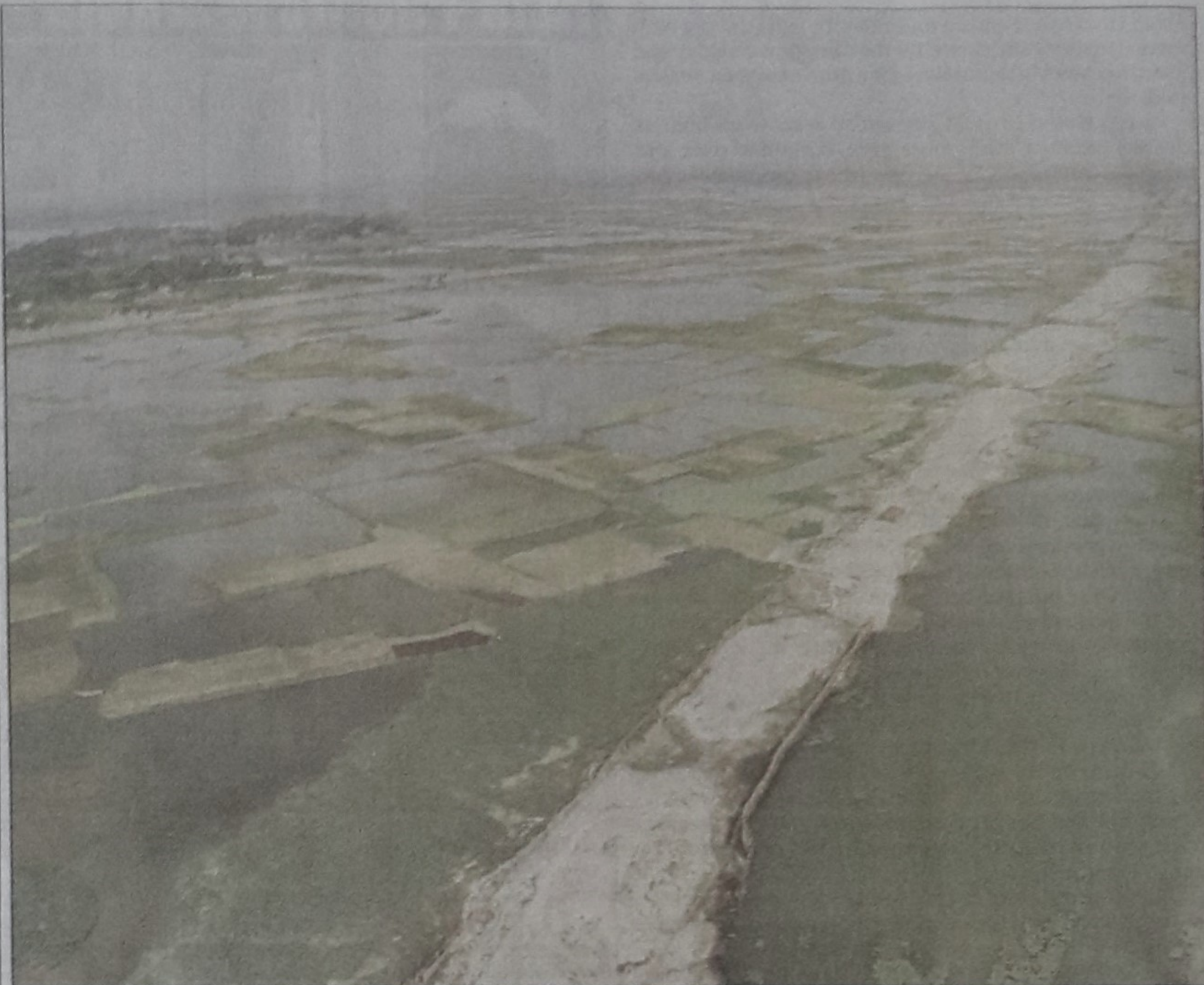
An aerial view of the long-abandoned Purbachal Link Road, work of which will resume next month.

The official admitted the lack of proper monitoring on city hotels but said they do not have skilled and specialised manpower to do the task.