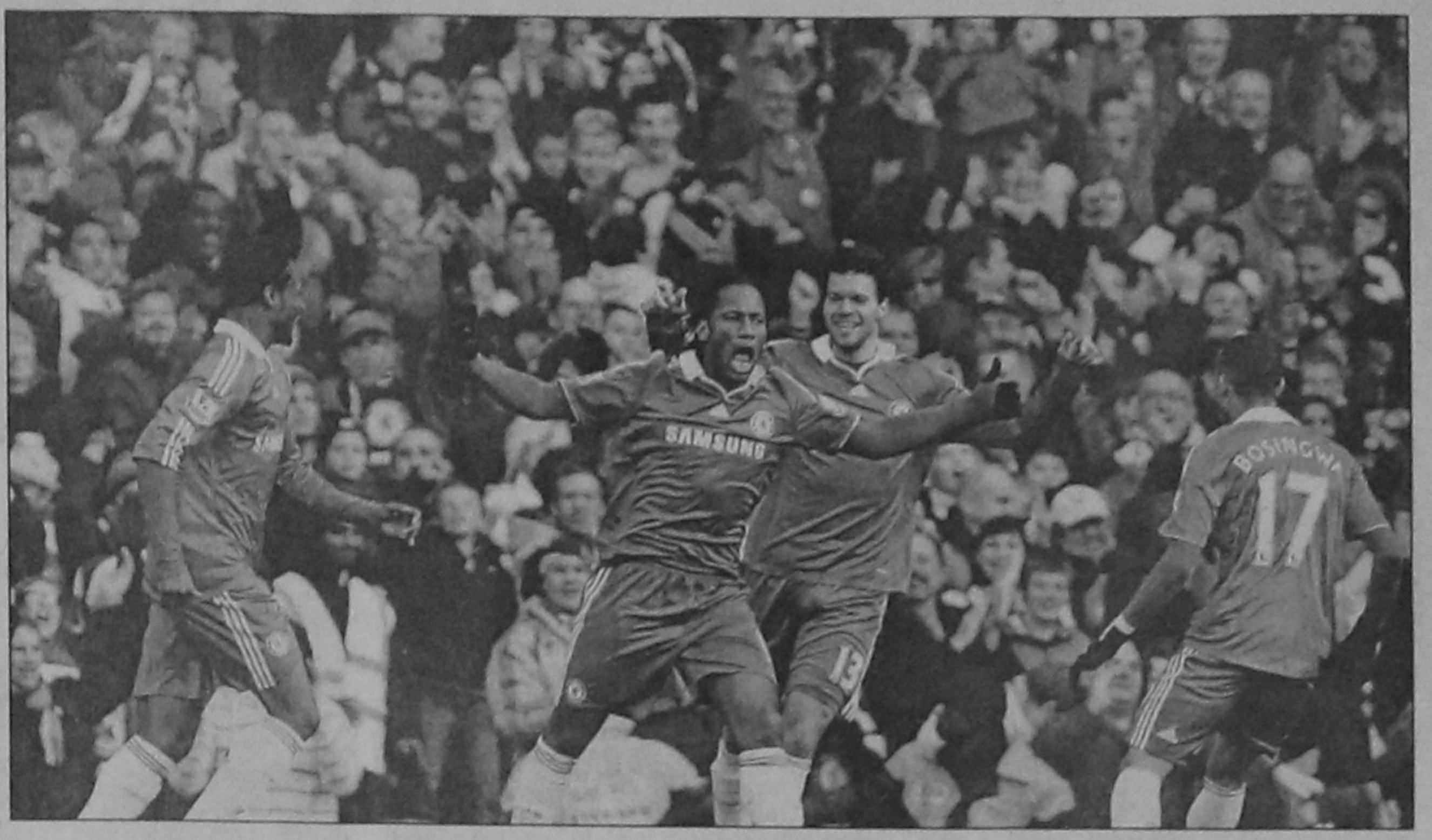
Chelsea striker Didier Drogba (2nd from L) is ecstatic after scoring the opening goal against West Bromwich Albion during their Premiership match at Stamford Bridge on Friday.