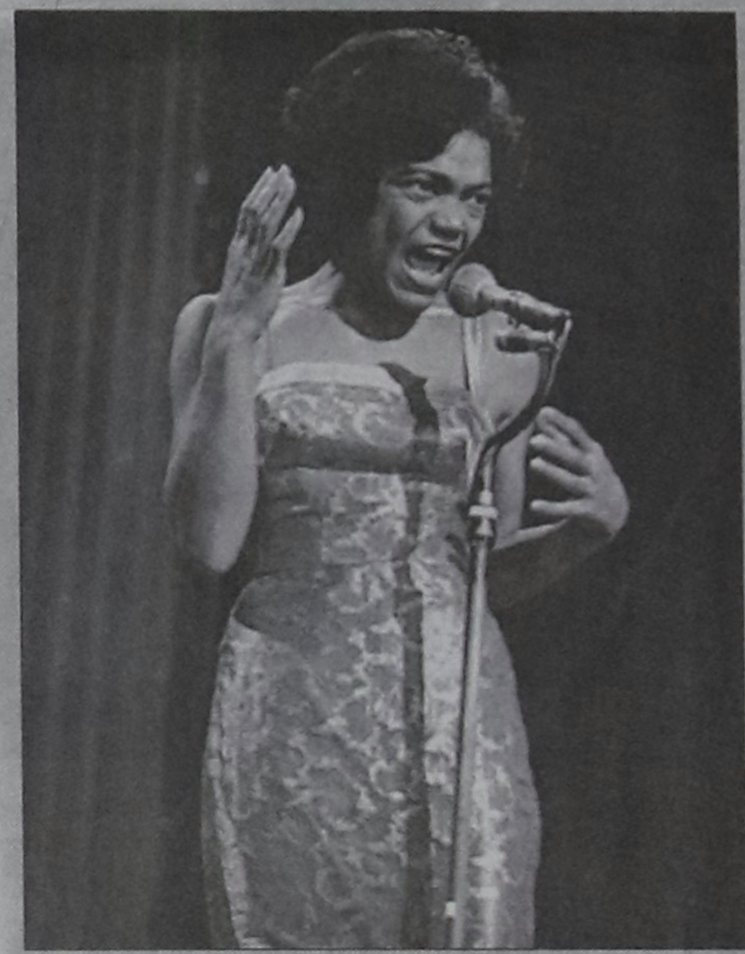
Eartha Kitt performing in London in 1960.

She also played serious roles, appearing in the films "The Mark of the Hawk" with Sidney Poitier (1957) and "Anna Lucasta" (1959) with Sammy Davis Jr. She made numerous television appearances, including a guest spot on "I Spy" in 1965, which brought her the first Emmy nomination.