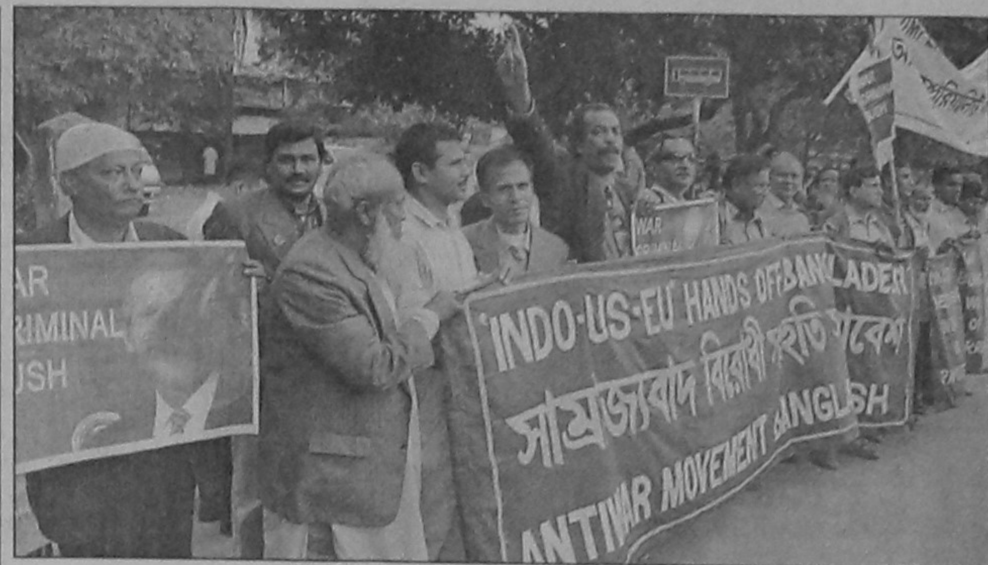
Anti-War Movement Bangladesh holds an anti-imperialism solidarity rally at Muktangan in the city yesterday.

Bangladesh Rifles (BDR) and Border Security Force (BSF) of India at a flag meeting yesterday agreed to strengthen their vigilance along the border to stop smuggle of explosives and arms to Bangladesh ahead of 9th national election on December 29. The sector commander level flag meeting between Dinajpur sector of BDR and Raiganj sector of BSF was held at Shukandighi of Thakurgaon Sadar upazila. Col Md Rezaul Kabir of BDR Dinajpur Sector led Bangladesh while Shree Sanjib Bhanot DIG of BSF Raiganj Sector led India in the meeting. Commanders of BDR and BSF of different battalions were present at the meeting. The flag meeting also agreed to maintain biological security at the shared borders under both the sectors so that bird flu cannot spread as Indian part of the border area is witnessing severe infection area, according to the BDR officials. The meeting also agreed to work jointly to stop drug smuggling into Bangladesh. Raiganj sector commander ensured his all out support in this regard to drug padding.