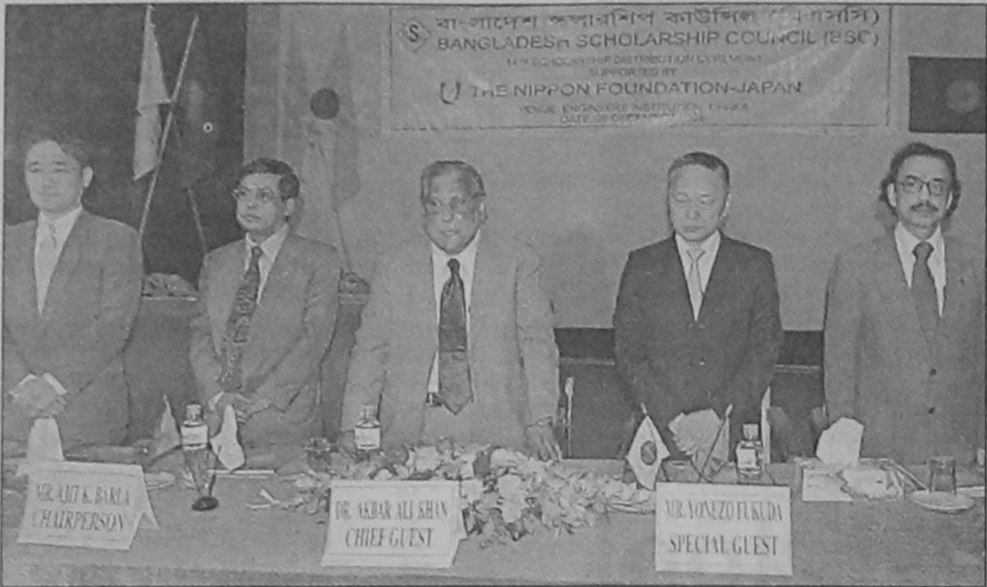
Guests pose for photograph at the 14th annual scholarship distribution programme of Bangladesh Scholarship Council at Engineers' Institute auditorium in the city yesterday.