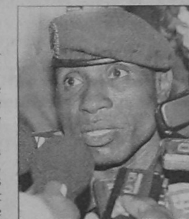
Moussa Dadis Camara

In a show of force, Camara paraded through the capital on Wednesday with hundreds of soldiers before announcing he was the new "president of