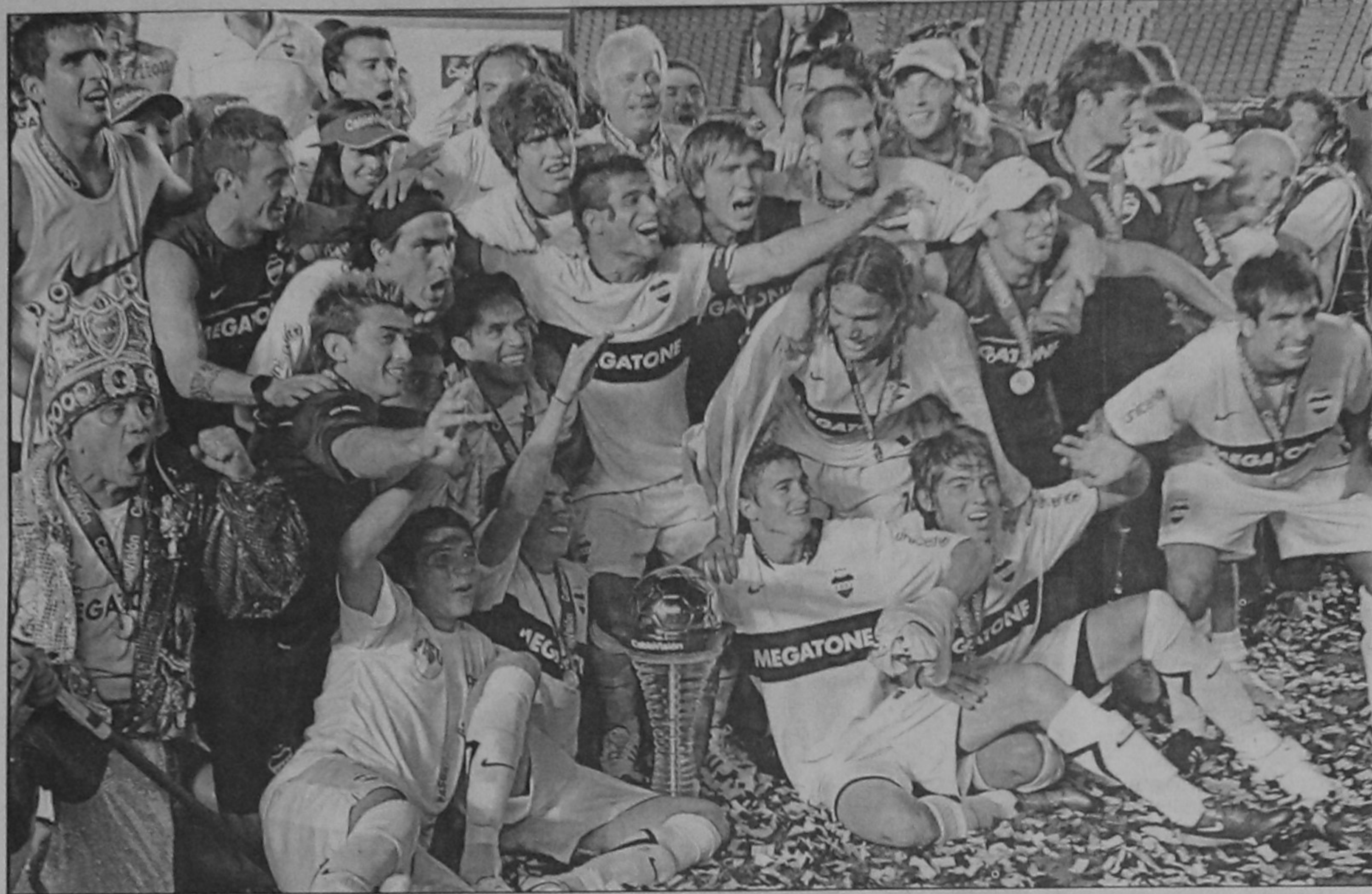
Boca Juniors players celebrate with the trophy after winning the Argentine football league's Apertura Championship at the President Juan Domingo Peron Stadium in Buenos Aires on Tuesday.