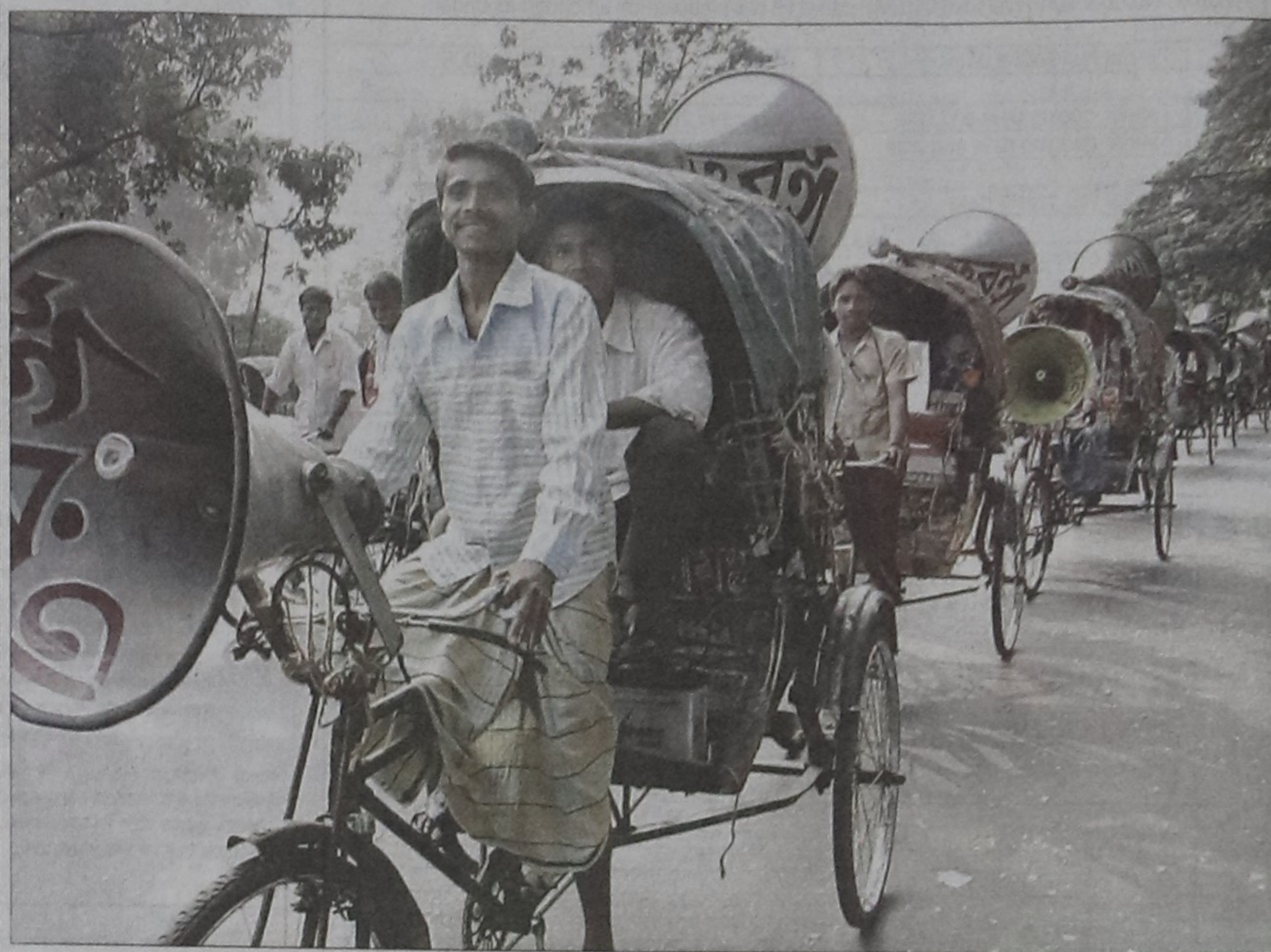
ELECTION FEVER: Loudspeakers set in a line of rickshaws relaying polls campaign message near Doel Chattar on Dhaka University campus yesterday.