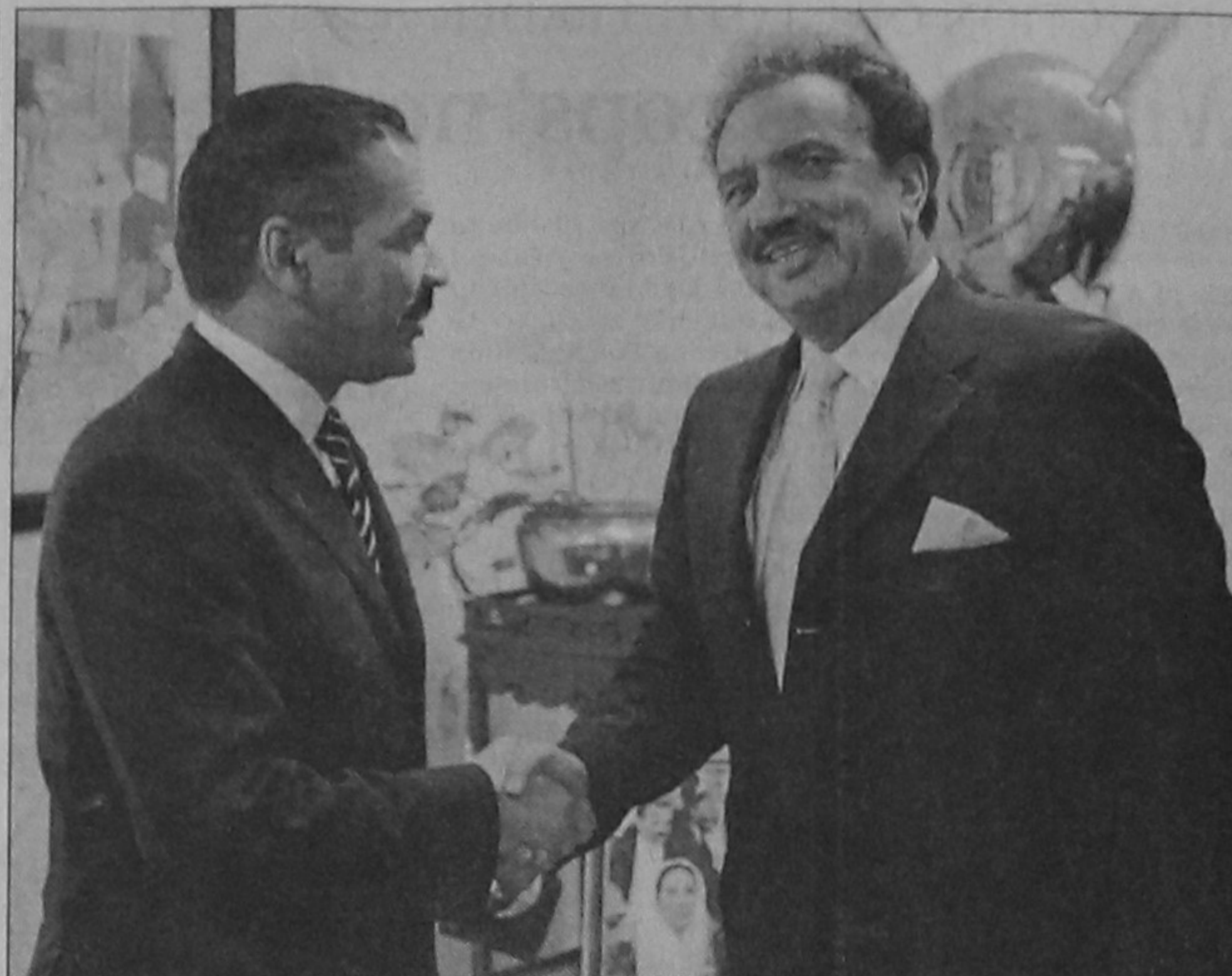
Pakistani Interior Minister Rehman Malik (R) shakes hands with Interpol secretary-general Ronald Noble in Islamabad yesterday. The Interpol chief said that India had not yet authorised the sharing of any information with the global police agency about those allegedly involved in the Mumbai attacks.

The arrests came amid heightened tensions between India and Pakistan in the wake of the attacks in Mumbai, which New Delhi has blamed on a Pakistan-based militant group.