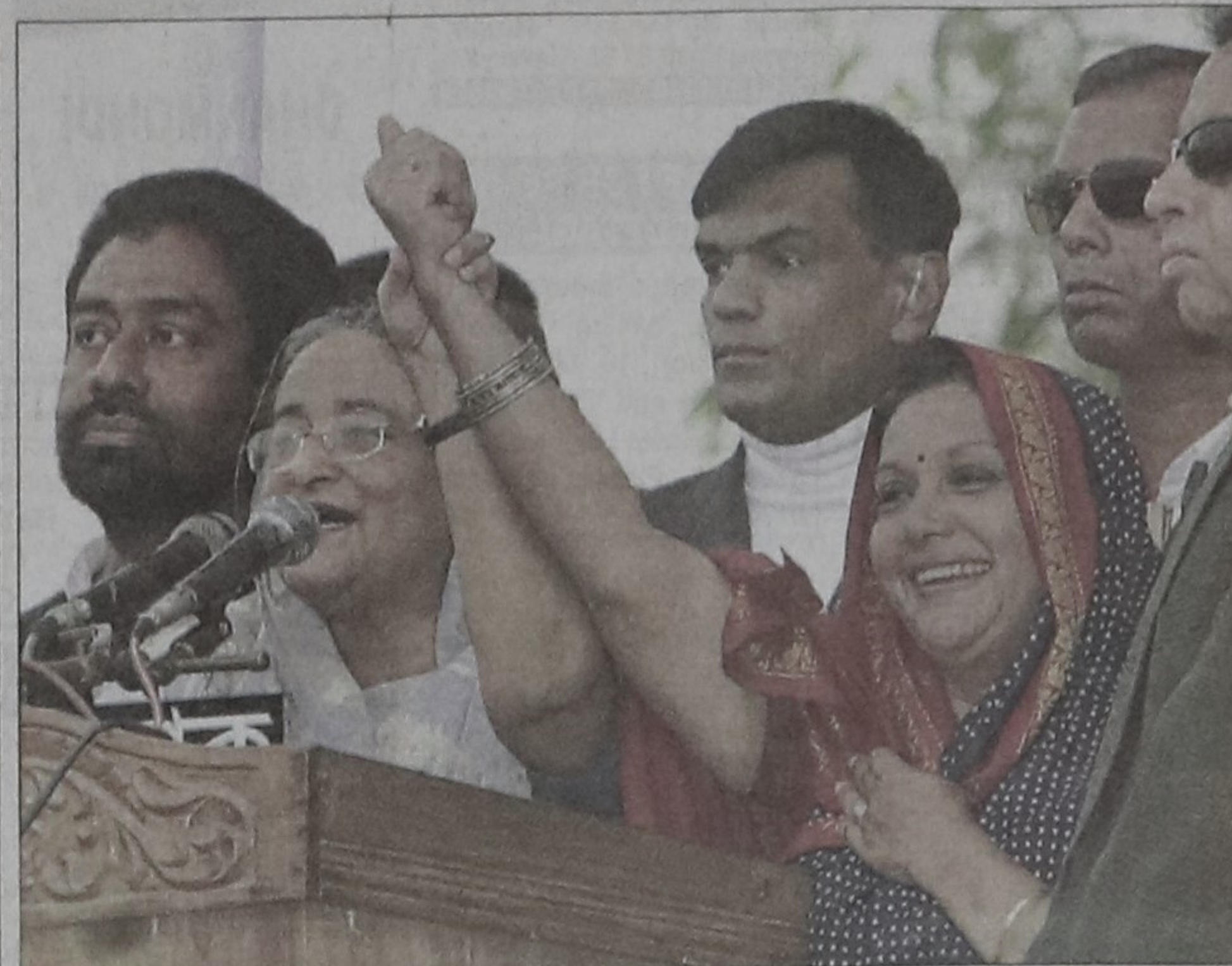
Awami League President Sheikh Hasina introduces her party candidate actress Sara Begum Kabari at an electoral meeting at Osmani Stadium in Narayanganj yesterday.