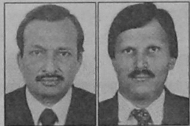
Mugdapara Samity executives

The students have been asked to complete admission procedures after contacting with offices of college principals by January 10, the release added.