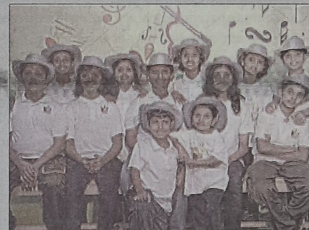
The remaining 12 contestants of "Meridian-Channel i Khudey Gaanraj '08".