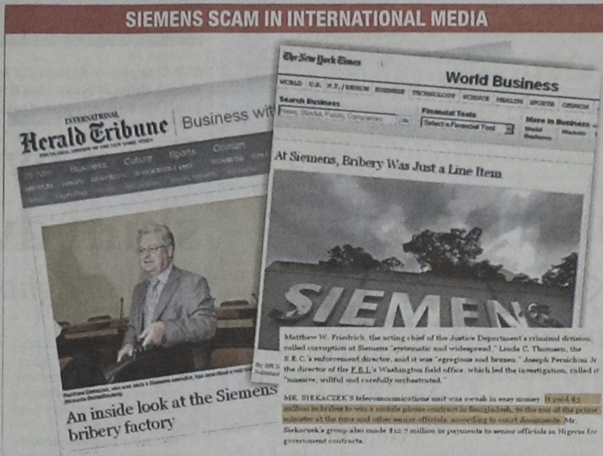
SIEMENS SCAM IN INTERNATIONAL MEDIA