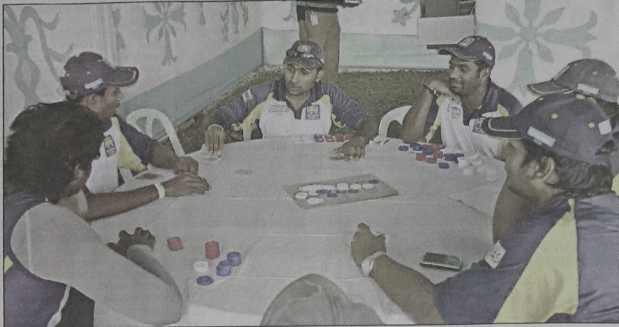
LET'S PLAY INDOOR SPORT: With dense fog dictating terms outside, the Sri Lankan cricketers are seen engrossed in a different kind of sport at the BKSP in Savar where the first day's play of the three-day practice against BCB XI was called off yesterday without a ball being

In the end the question was whether it the game could resume on the second day. The sunshine in the afternoon however gave the hope and without any doubt the visitors would be happy if they got the chance to have match practice before going into the main battle.