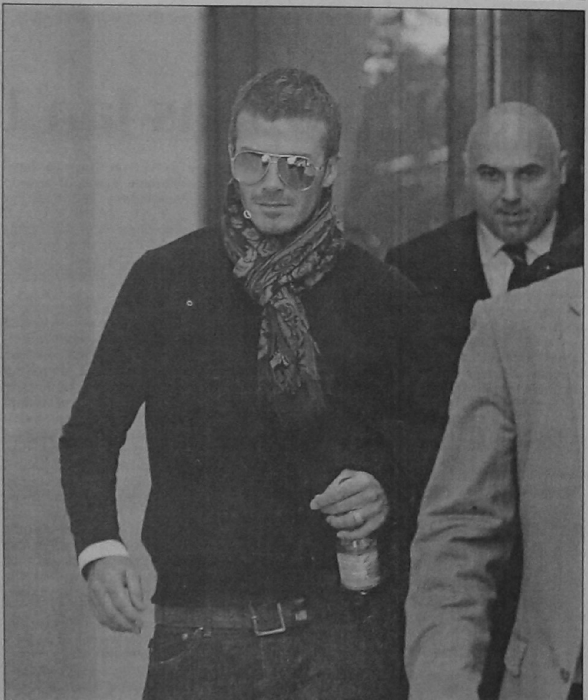
David Beckham (L) leaves a private clinic in Appiano Gentile in Como on Saturday. The former Manchester United and Real Madrid midfielder is joining Milan on loan from his current club Los Angeles Galaxy and will stay at San Siro until the end of March.

Sporting currently lie fourth in their domestic league while Munich are second in the German table.