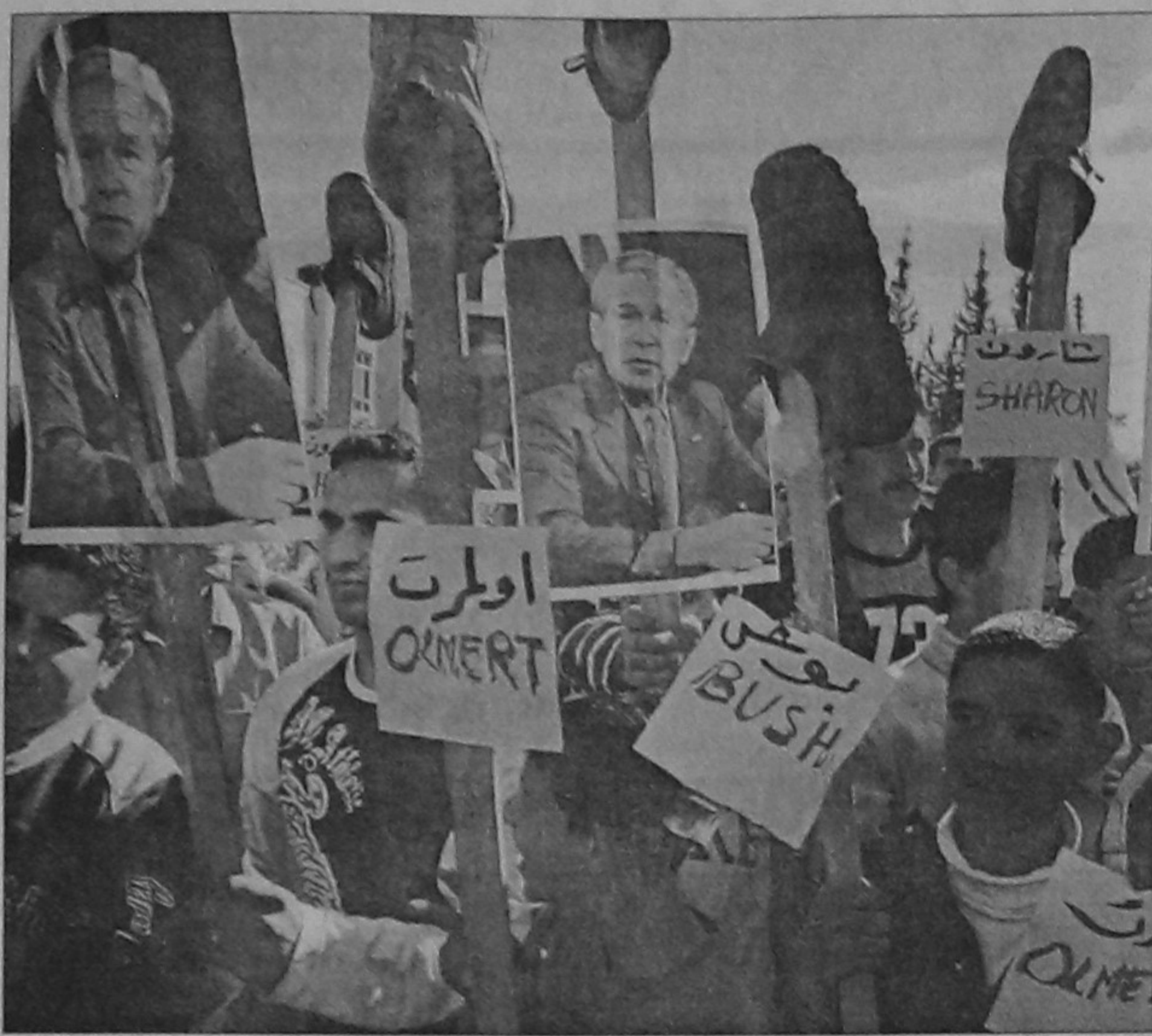
Palestinian demonstrators hold placards bearing portraits of US President George W. Bush, topped with shoes during a protest against Israel's separation barrier in the West Bank village of Bilin near Ramallah Friday. They also expressed solidarity with Iraqi journalist Muntazir al-Zaidi, who was arrested in Iraq after throwing his shoes at Bush.