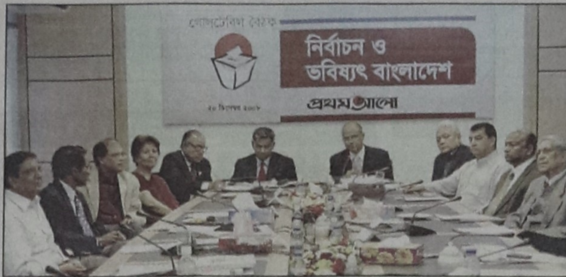
Participants at a roundtable on 'Election and Future Bangladesh' organised by the daily Prothom Alo at its office in the city yesterday. (Story on Page 1)