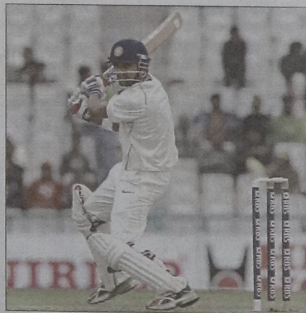
PURPLE PATCH CONTINUES: India opener Gautam Gambhir cuts the ball during his fourth Test hundred that came on the first day of the second Test against England at the PCA Stadium in Mohali yesterday.