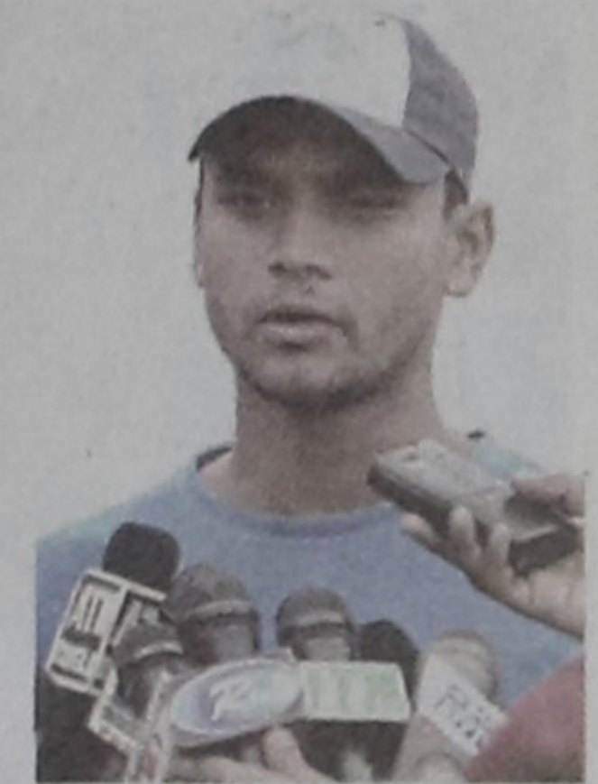
MASHRAFE BIN MORTAZA

But for all the challenges ahead the Tigers must find inspiration to succeed and Mashrafe mentioned the