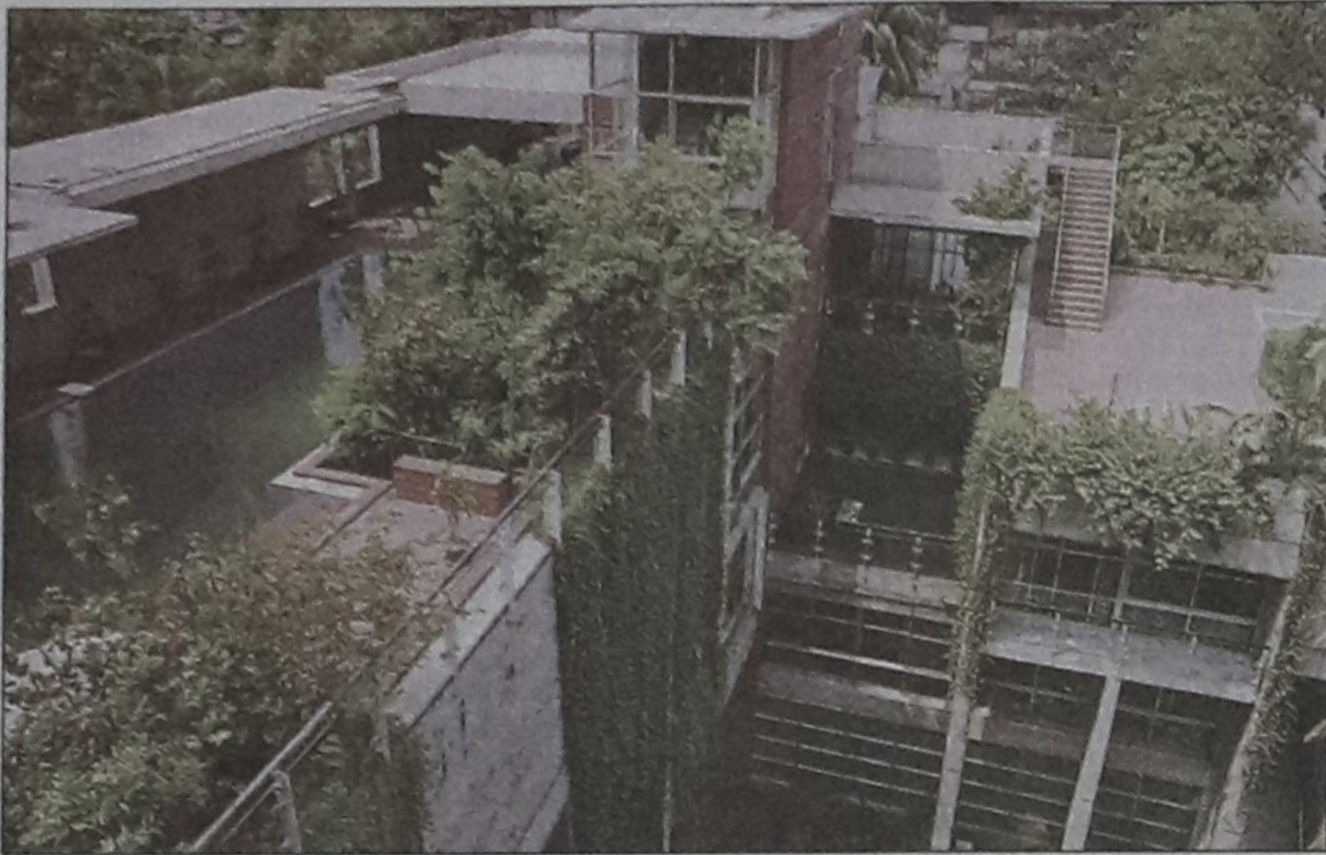
Rafiq Azam's designs stand out for their use of green, light and shade. In the midst of urban structures that desperately need it.

Rafiq Azam's architectural exhibition is now on at Bengal Gallery where photographs, drawings, video and models of his projects are on display. Azam's projects are scenic, open and eye-catching. His love of nature is interpreted with his frequent use of green