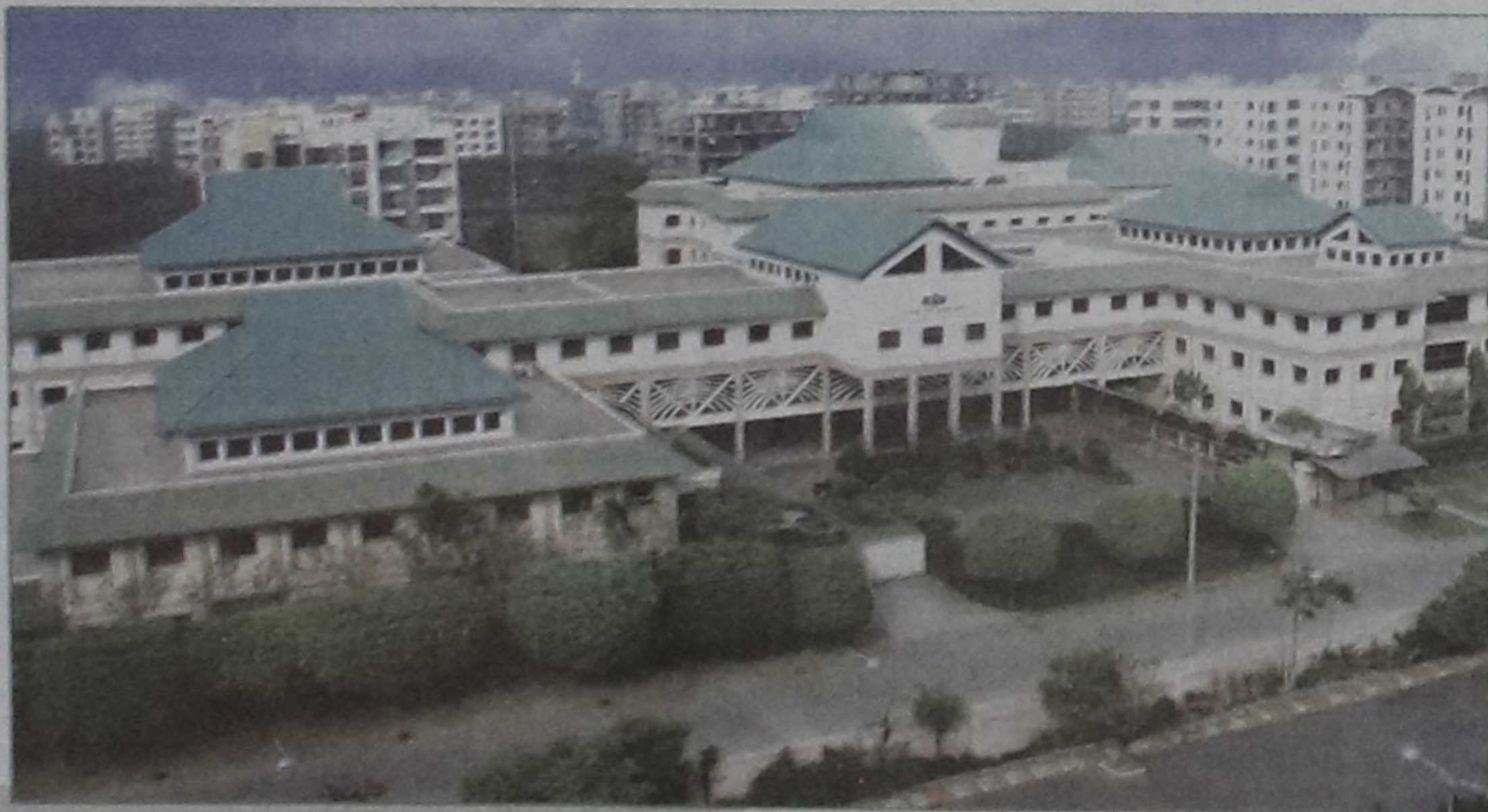
International School Dhaka (ISD)