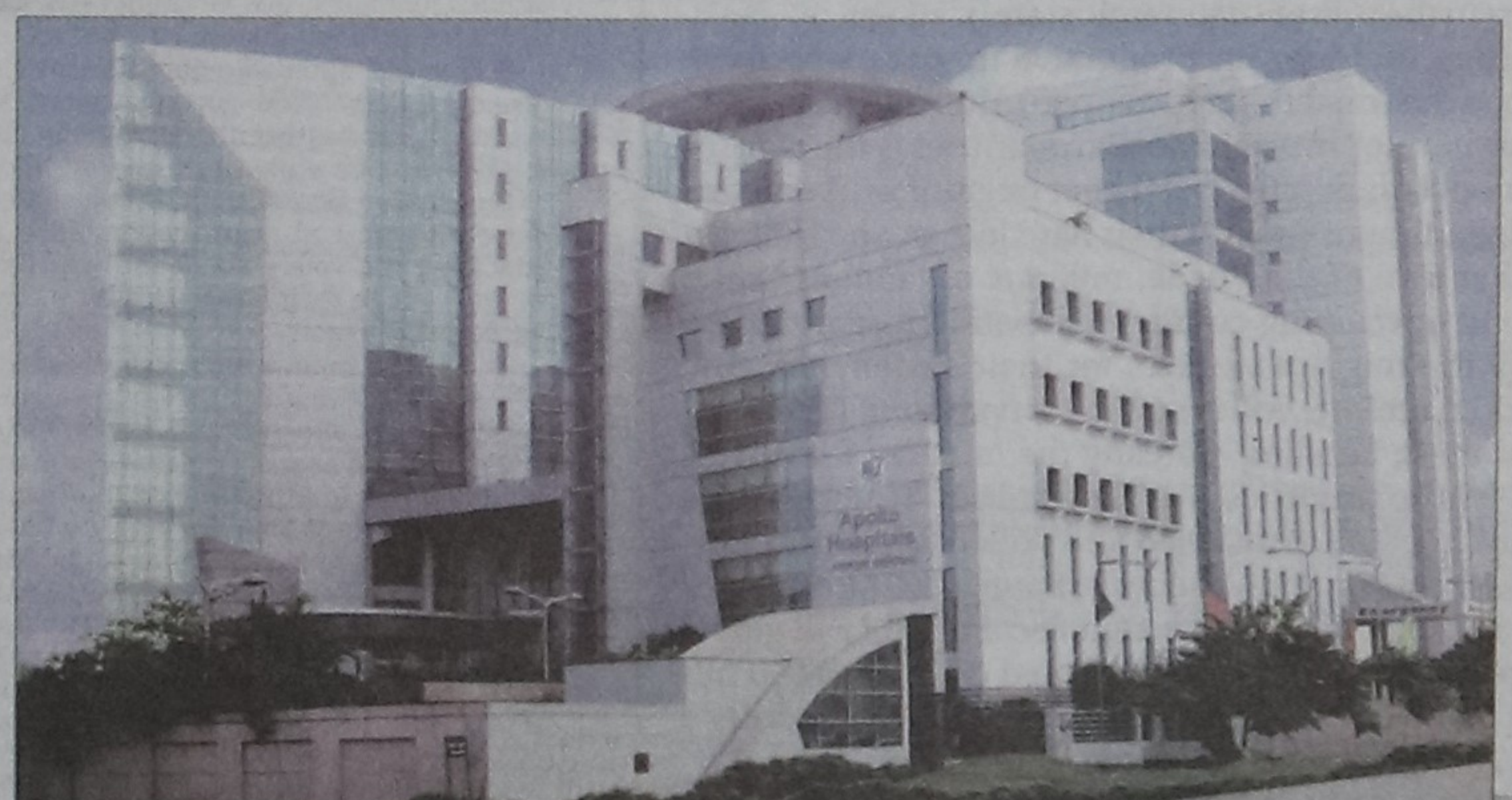
Apollo Hospitals Dhaka (AHD)