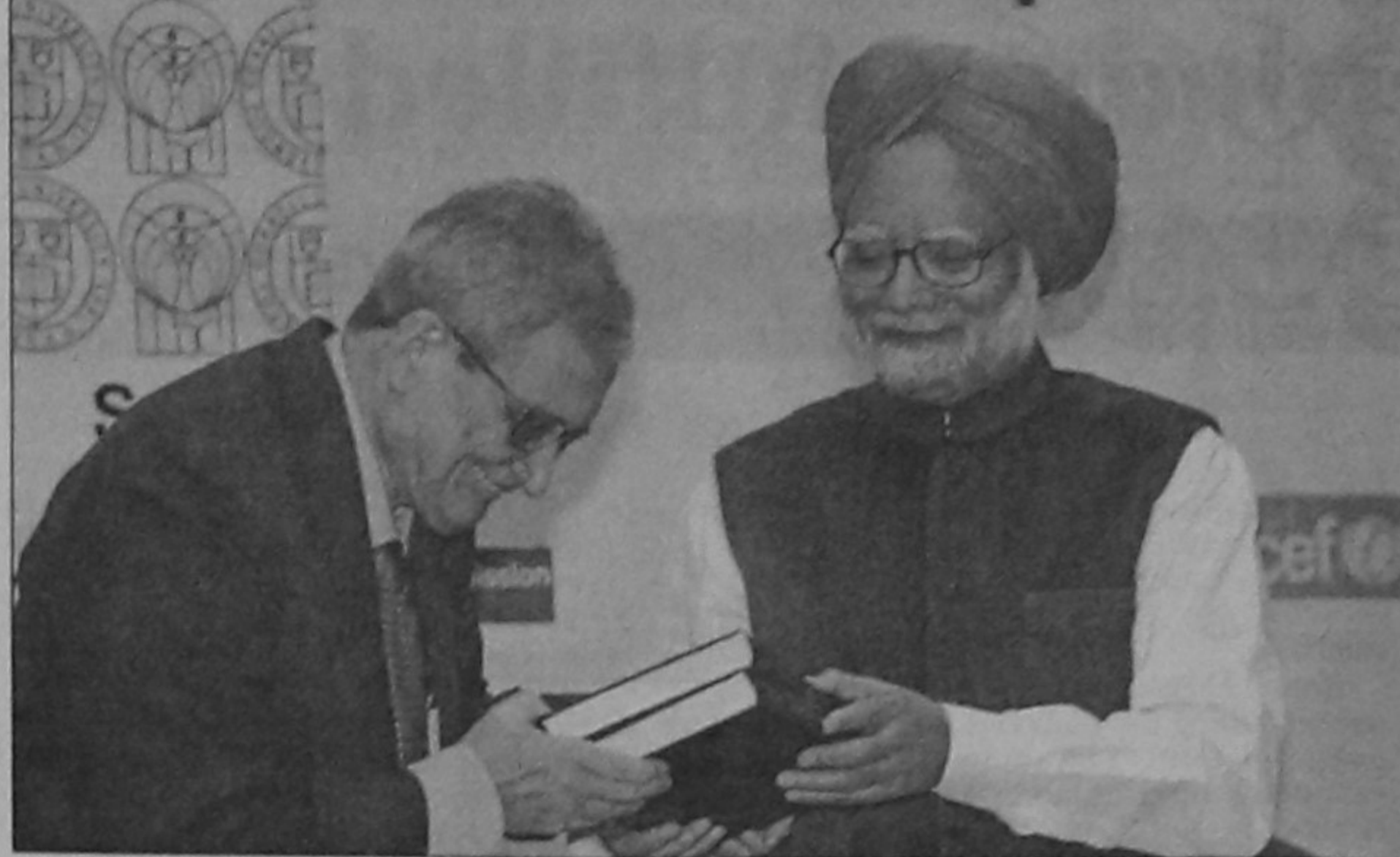
Indian Prime Minister Manmohan Singh (R) presents copies of 'Arguments for a Better World' to Nobel laureate and Professor of Harvard University Amartya Sen during an International Conference on Development, Freedom and Welfare conference in New Delhi yesterday. Manmohan inaugurated the two-day conference, which was organised by Cornell University and the Institute for Human Development.