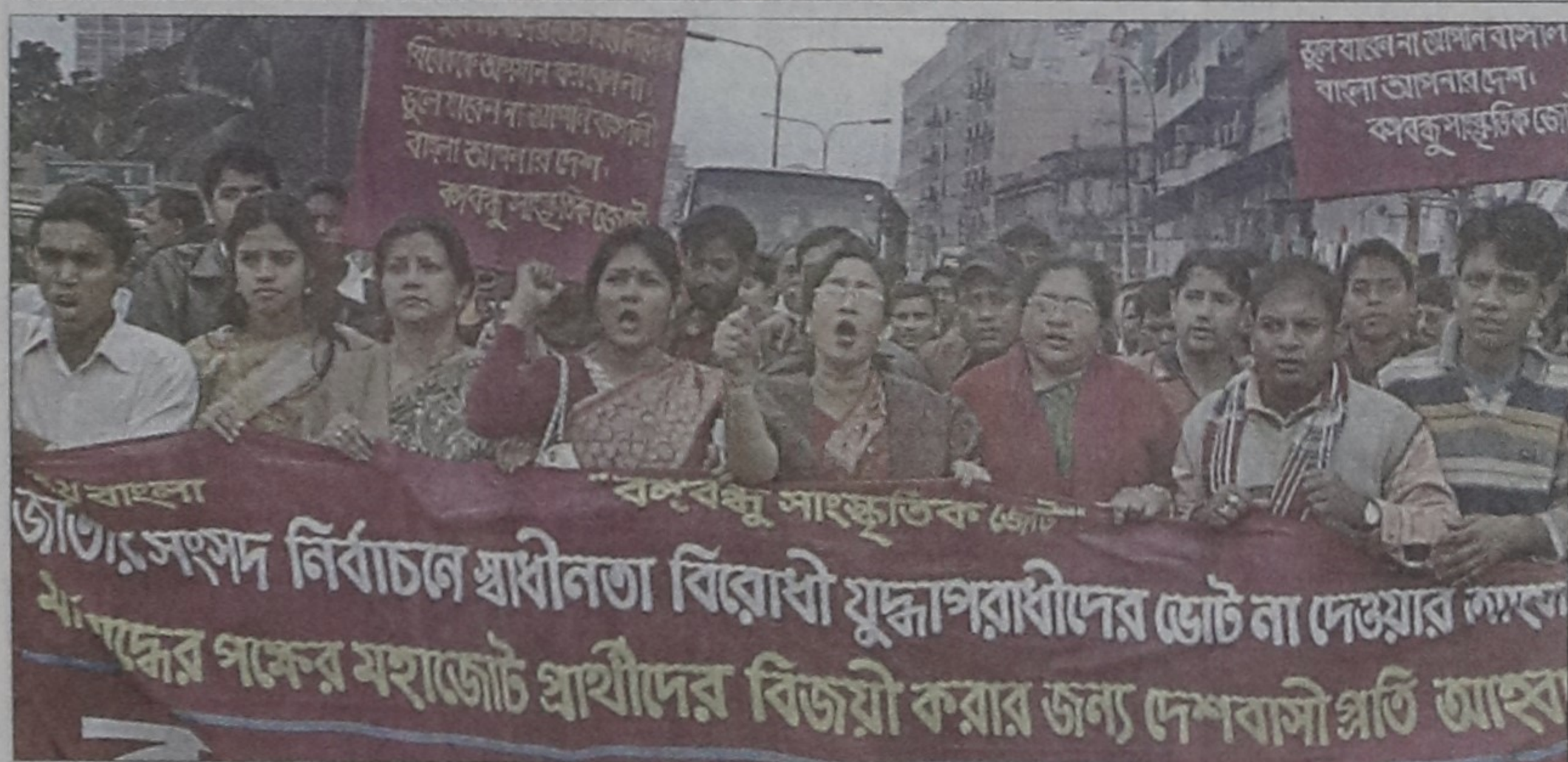
Bangabandhu Sangskritik Jote takes out a procession in the city yesterday with a call to reject war criminals and anti-liberation forces in the upcoming parliamentary elections.