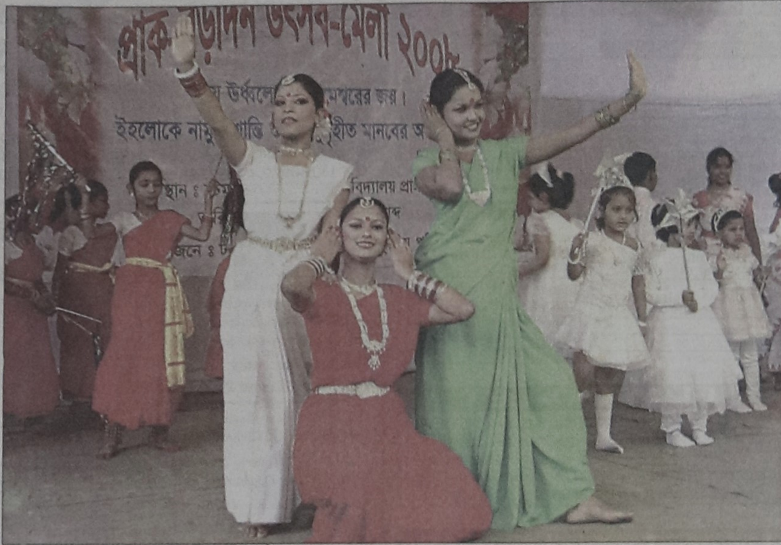
Children perform a dance at a pre-Christmas festival on the Batamali Homes Girls' High School premises at Tejgaon in the city yesterday. Dhaka Mahanagar Anchalik Palakiya Parishad organised the event.

As a result, a number of passenger trains, including inter-city Subarna Express, Mohanagar Godhuli and Upakul Express, remained stranded on different stations.