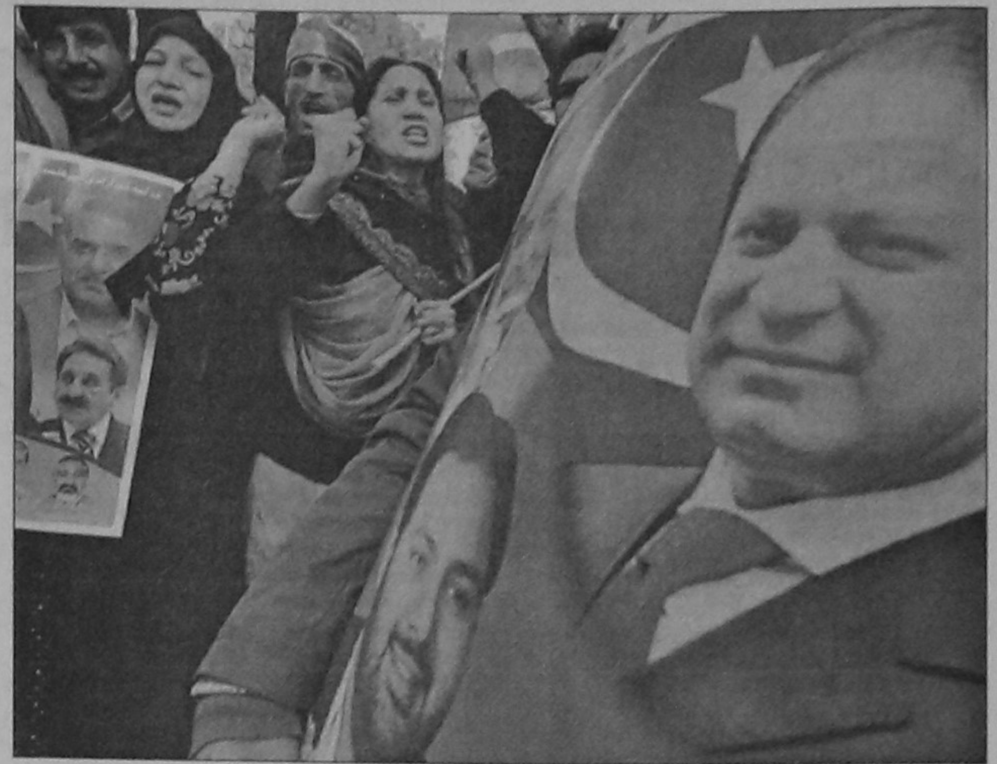
Pakistani lawyers and political party activists shout slogans during a demonstration in Lahore yesterday demanding the restoration of the Pakistani judiciary and protesting against recent airspace violations by Indian Air Force aircraft.

The rally came amid a recent spike in attacks by Taliban militants on Nato and US supply depots on Peshawar's outskirts, close to Pakistan's lawless tribal areas -- a hotbed of Taliban and al-Qaeda activity.