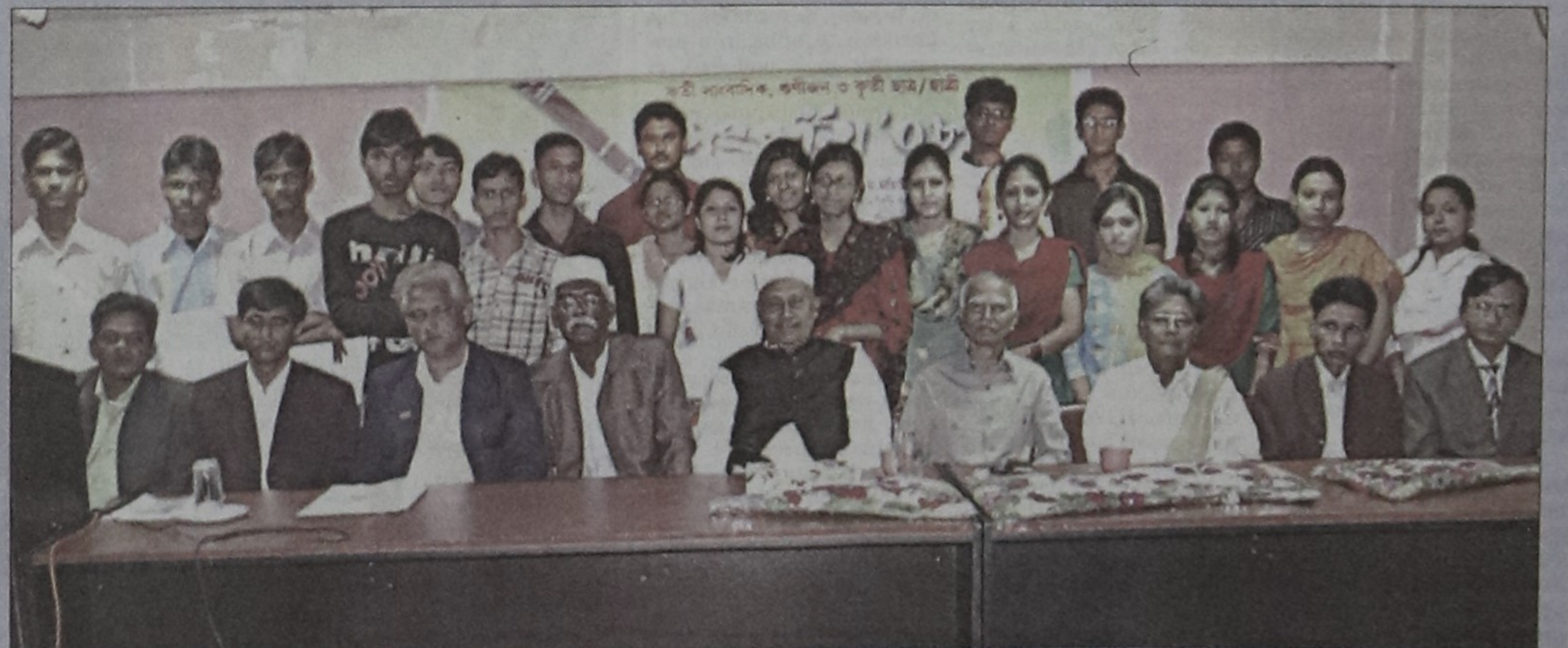
Journalists and students pose for photograph with the guests at a reception organised by Chittagong Press Club on Tuesday.