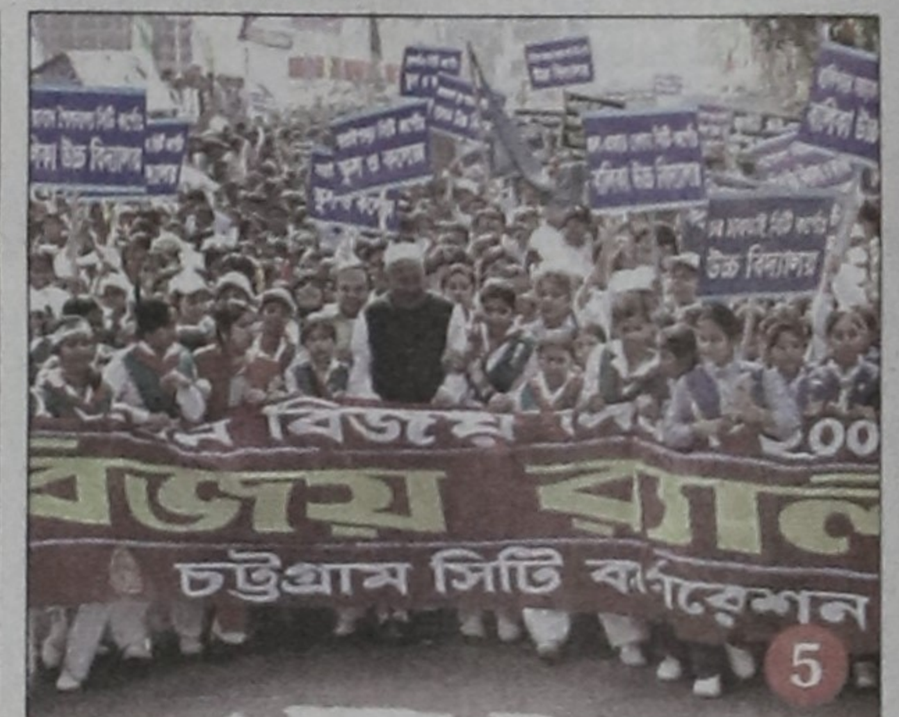
People from all walks of life celebrate Victory Day in the port city on December 16 amid festivity and enthusiasm and paid homage to the martyrs of War of Liberation. 1. A child places wreaths, 2. Awami League leaders place wreaths and 3. Bangladesh Nationalist Party (BNP) leaders place wreaths at Shaheed Minar in the port city, 4. School children take part in a Victory Day programme at MA Aziz Stadium and 5. Victory Day rally organised by Chittagong City Corporation at Laldighi Road.