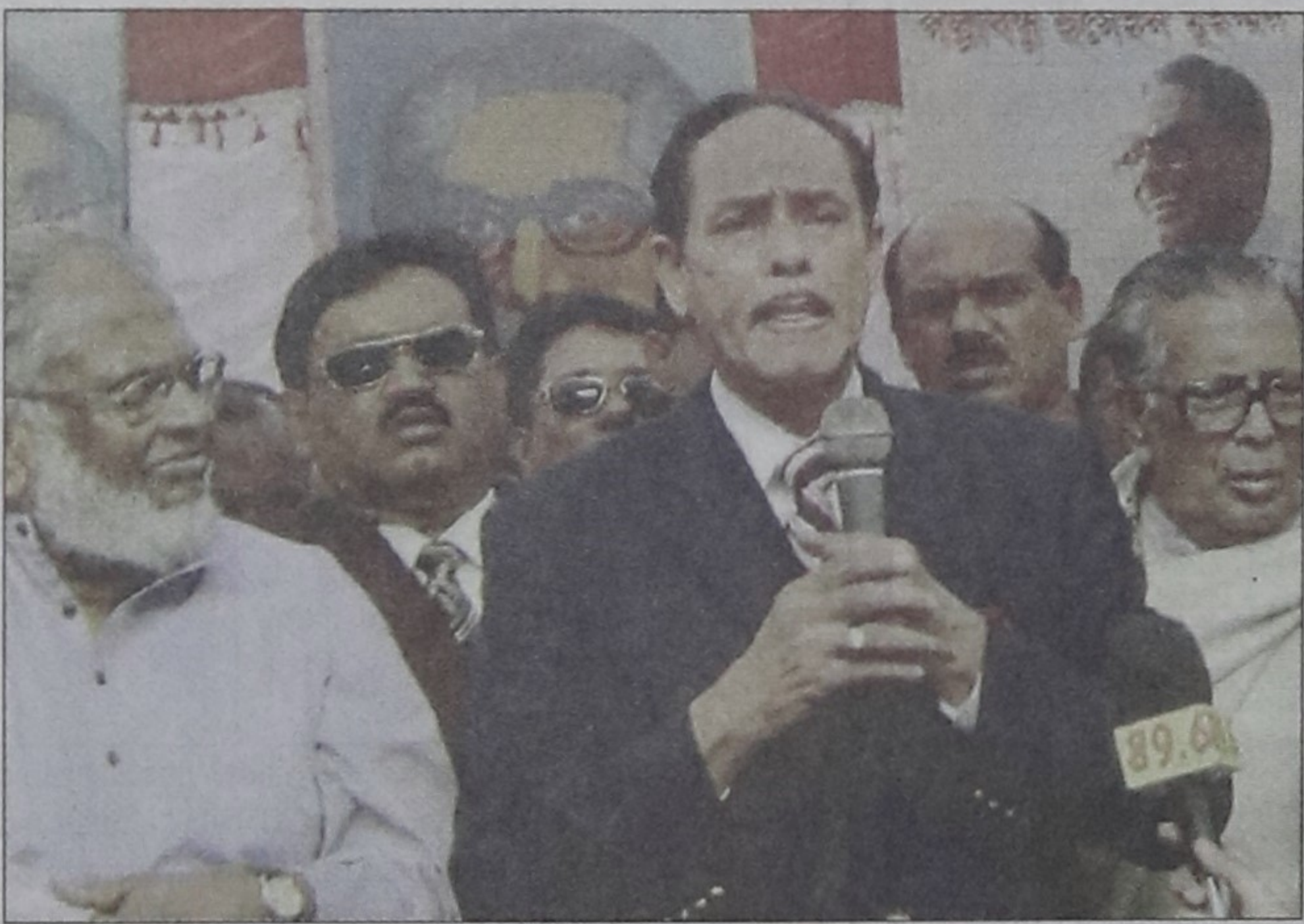
Jatiya Party Chairman HM Ershad addressing a wayside meeting at Nomanai Maidan in Magura town in support of grand alliance candidate for Magura-1 yesterday.