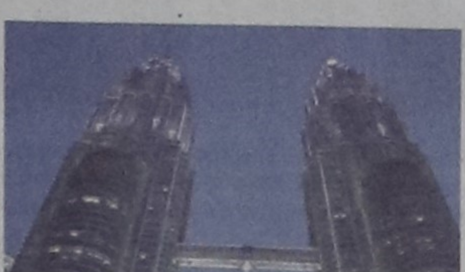
মালয়েশিয়ার পেট্রোনাস টুইন টাওয়ার