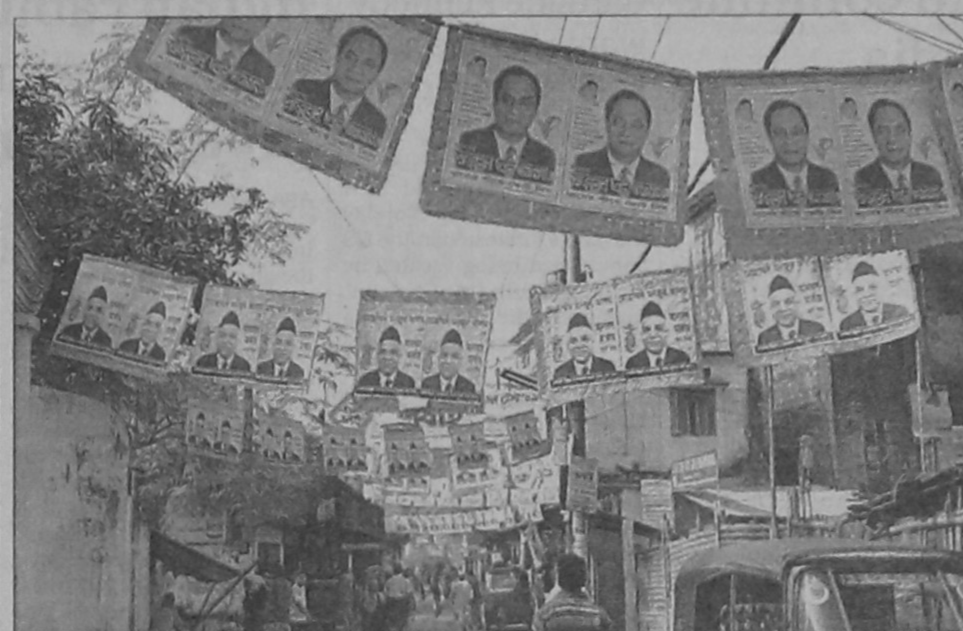
Posters have flooded nooks and corners of Chittagong city as polls campaign gains momentum. The picture was taken from Agrabad Mistripara area yesterday.