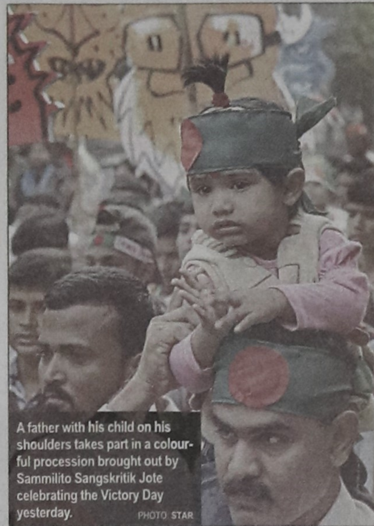
A father with his child on his shoulders takes part in a colourful procession brought out by Sammito Sangskritik Jote celebrating the Victory Day yesterday.