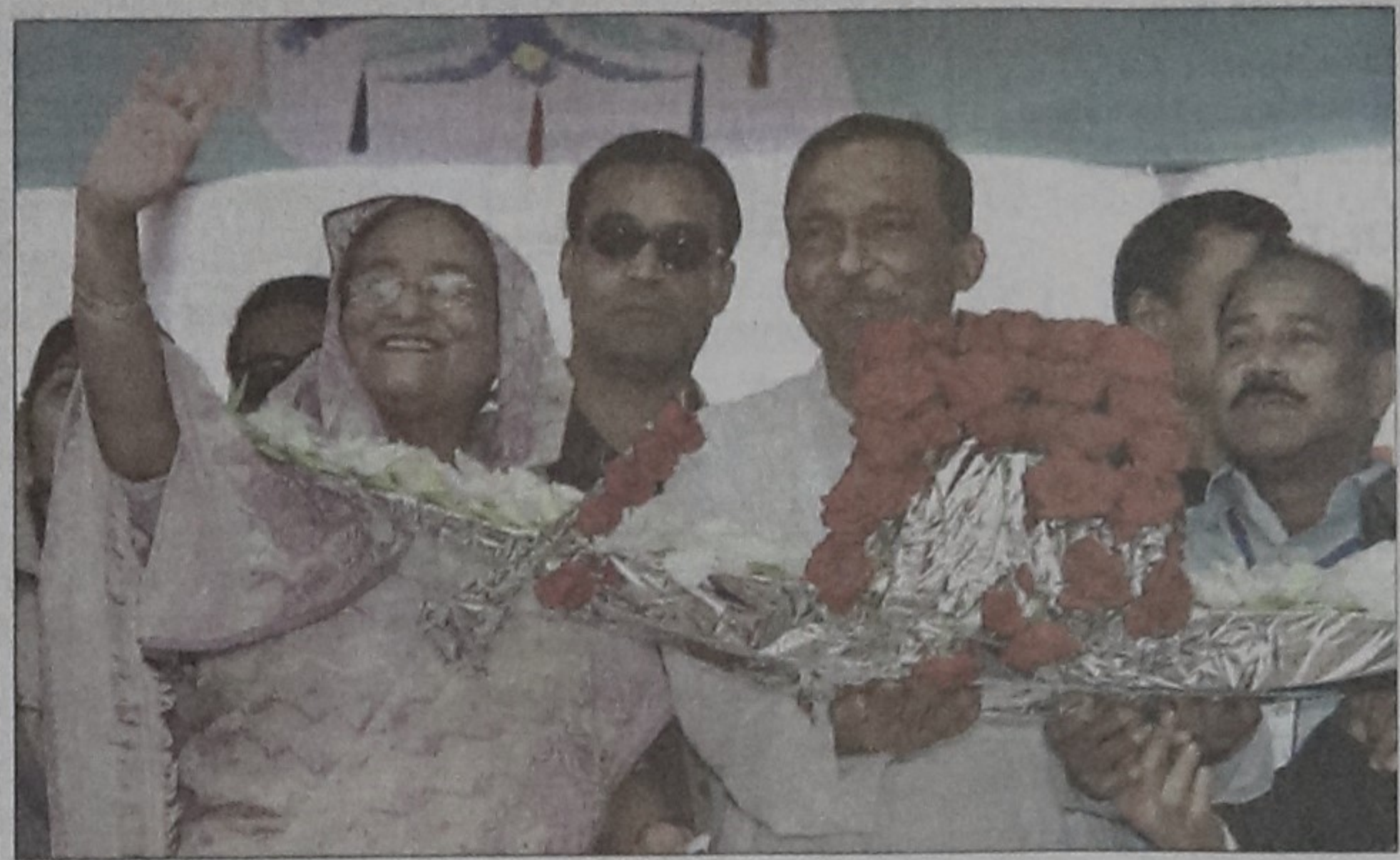
Awami League President Sheikh Hasina introduces Asaduzzaman Khan Kamal, the candidate of AL-led grand alliance from Dhaka-11, at an election rally at Karwan Bazar in the city yesterday.

The CA returned to the capital in the afternoon.