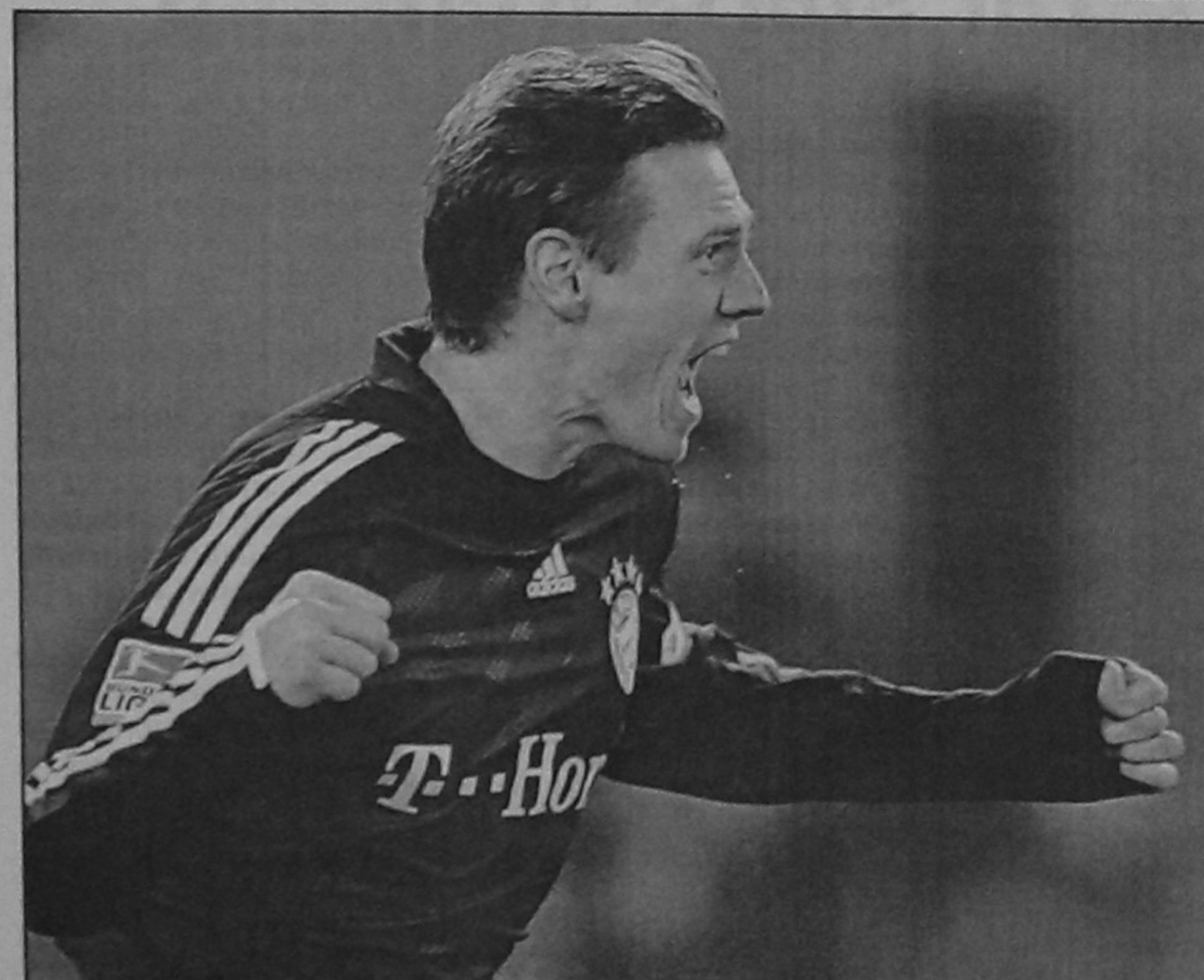
Bayern Munich midfielder Tim Borowski celebrates his equalising goal against VfB Stuttgart during their crunch Bundesliga tie at Stuttgart on Saturday. Borowski scored one and made the other as Bayern took the lead before falling behind to a last grasp Sami Khedira strike. The point meant that Bayern made it to the top of the Bundesliga before the traditional winter break sets in.

On Friday night, Borussia Dortmund moved up to sixth in the league after their 2-1 win over the league's bottom side Borussia Moenchengladbach.